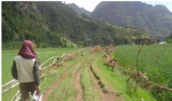
Trekking road towards the lodge

Liq-Marefiya lodge is located in Ankober Wereda in altitude of 2498masl across the Ankober Palace lodge in a distance of 12km off to the main road. There is an access of road to use vehicle. The place has got its name by the late 19th, while the then king of Ethiopia, Menelik II, has let the intellectuals, mainly the foreigners, to live in this area. Hence, the name of the area has been driven from the presence of the intellectuals. To cement this story, you can find the Tomb of a well-known Italian geographer and explore, Antinori. It is also a place where Jewish people, called Falasha communities, mean the exodus from Israel are living. In addition, there are amazing and interesting gifts in the area like caves available in the forest, small ponds with many birds living, the ruins of first Flour Mill and Mortal Machine found. From this campsite, it is also possible to make the trekking inside the jungle forest towards Wof Washa Genet or Mescha as well.