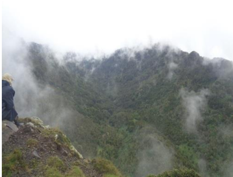
Wof Washa Forest

This KBA supports the only known population of Vulnerable Ankober Serin Crithagra ankoberensis , a species confined to areas between 2,800 m and 3,750 m along the escarpment. The site also hosts the famous Gelada Baboon Theropithecus gelada and potentially (not seen for a long time!) the even more famous, though Endangered, Ethiopian Wolf Canis simensis . A decade ago, the forest cover was more than 16,000ha. Now, it is