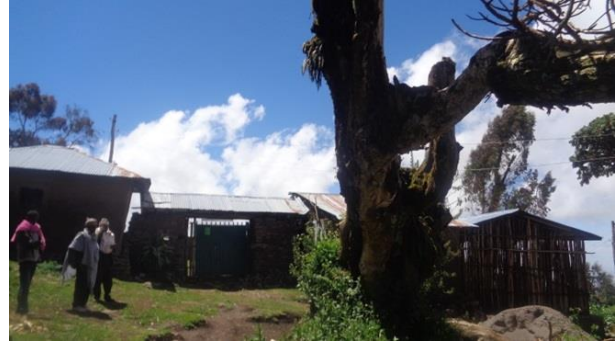
Historical Kosso tree planted by the then King of Ethiopia at about 1809

Liq-Marefiya lodge is located in Ankober Wereda in altitude of 2498masl across the Ankober Palace lodge in a distance of 12km off to the main road. There is an access of road to use vehicle. The place has got its name by the late 19th, while the then king of Ethiopia, Menelik II, has let the intellectuals, mainly the foreigners, to live in this area. Hence, the name of the area has been driven from the presence of the intellectuals. To cement this story, you can find the Tomb of a well-known Italian geographer and explore, Antinori. It is also a place where Jewish people, called Falasha communities, mean the exodus from Israel are living. In addition, there are amazing and interesting gifts in the area like caves available in the forest, small ponds with many birds living, the ruins of first Flour Mill and Mortal Machine found. From this campsite, it is also possible to make the trekking inside the jungle forest towards Wof Washa Genet or Mescha as well.