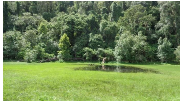
The epicentre of the forest trekking road

Mescha lodge is known as the place where ‘Miracle Food That Saved the People of Mescha, /Manna/’, like a miracle Mosses has received from God a supernatural food. Hence, the name has driven from this episode. It is located in one of the rift valley lines of the KBA with altitude of 2794masl. The campsite is adjacent to the forest with possibility of observing fascinating landscape, watching birds and also seeing of wildlife. In addition to this, area is very known by the ‘Map of Ethiopia’ depicted inside the forest, alleged to be in drawn in the late 19th century. It has a distance of 13km from the main road off and possibly used to walk through the valley either on foot or possibly use horse. You can back to Wof washa genet or Goshu-Meda lodge,