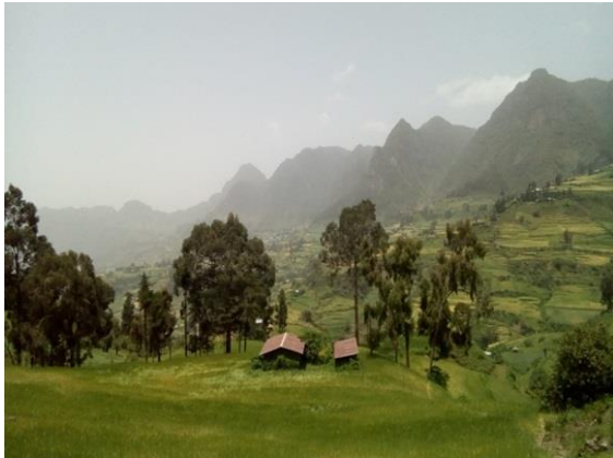
Mountain chains viewed at the campsite

rather than returning to the same trek. The trekking will be alongside to the gentle forest of Wof Washa Natural Forest.