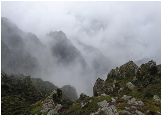
View of Goshu Meda

Goshu-Meda lodge is the highest lodge from Wof Washa Community lodges in altitude of 3540masl. You can access the lodge in the way to other lodges, found in the first track of the trekking roots. It is found 6km off to the main road and access it by horse or may be possible to take a walk on foot. In the amid of the lodge, across the lodge trek, you can view an wonderful landscape and possible to watch birds and even wildlife, like antelope, Ethiopian Wolf, Chilada Baboon, etc. while arriving at the lodge, you can see the down streams easily and have a chance to seat 'pick of the mountain found in this particular area called as Hail-Sillassie(3532masl), the pick where Emperor Haile-Selassie was supposed to sit on the peak to watch the lowland peoples activity. There is also a cave known as Dejach Mengesha cave, named by the governor of the area. It was used to make meetings and also for recreation purpose. From this campsite, it is possible to elongate the trip or the trekking along to Mescha, Wof Washa Genet and also Kundi.