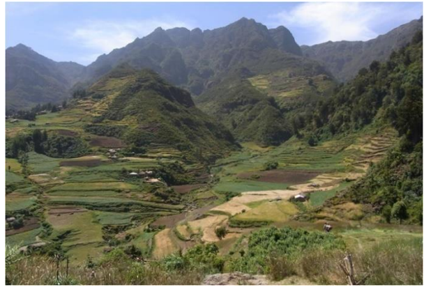
The view of the lodge