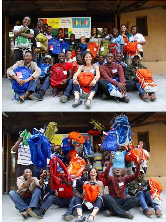
Participants receive packs from Osprey Packs

The Lost Mountain Consortium is directed by US-based Additive Adventure and Mozambique-based LUPA. The Lost Mountain is supported in part from a grant from the Critical Ecosystem Partnership Fund—a joint initiative of l'Agence Française de Développement, Conservation International, the European Union, the Global Environment Facility, the Government of Japan, the MacArthur Foundation and the World Bank. The Lost Mountain Next Gen Initiative is made possible by the support of Positive Tracks, Ethiopian Airlines, Osprey Packs and Goal Zero. With