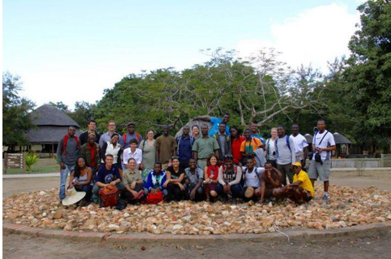
Participants of the Next Gen Symposium

Drawing expertise from Princeton University to University of KwaZulu Natal, the Lost Mountain Symposium is diversifying groups' planning process, recognizing the strength, innovation and creativity that comes with bringing younger students with fresh perspectives onto the team.