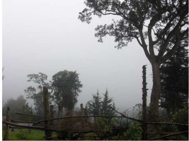
Mist on the Kikuyu Escarpment (image MM)

It was taken as a good sign by the remaining guests who toasted to KENVO's future with their bottles of ForestMist.