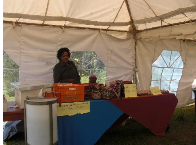
One of the women groups was selling their products at the event on 17 June

But it was the third pillar, employment, that was the focus of the recent events at the KENVO Resource Center in Kimende, on the Kikuyu Escarpment.