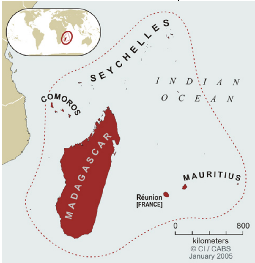
Figure 1. General Map of the Madagascar and Indian Ocean Islands Hotspot

CEPF is a joint initiative of l'Agence Française de Développement, Conservation International, the European Union, the Global Environment Facility, the Government of Japan, the MacArthur Foundation and the World Bank. The investment in the Madagascar and Indian Ocean Islands Hotspot benefits from an additional contribution from the Leona M. and Harry B. Helmsley Charitable Trust.