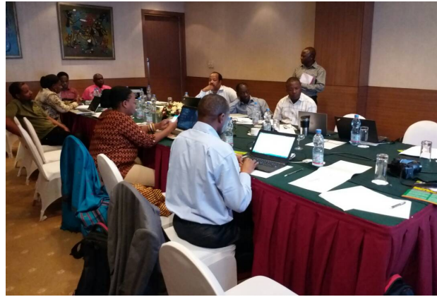
CSO and Government representatives during the consultation workshop in Dar es Salaam