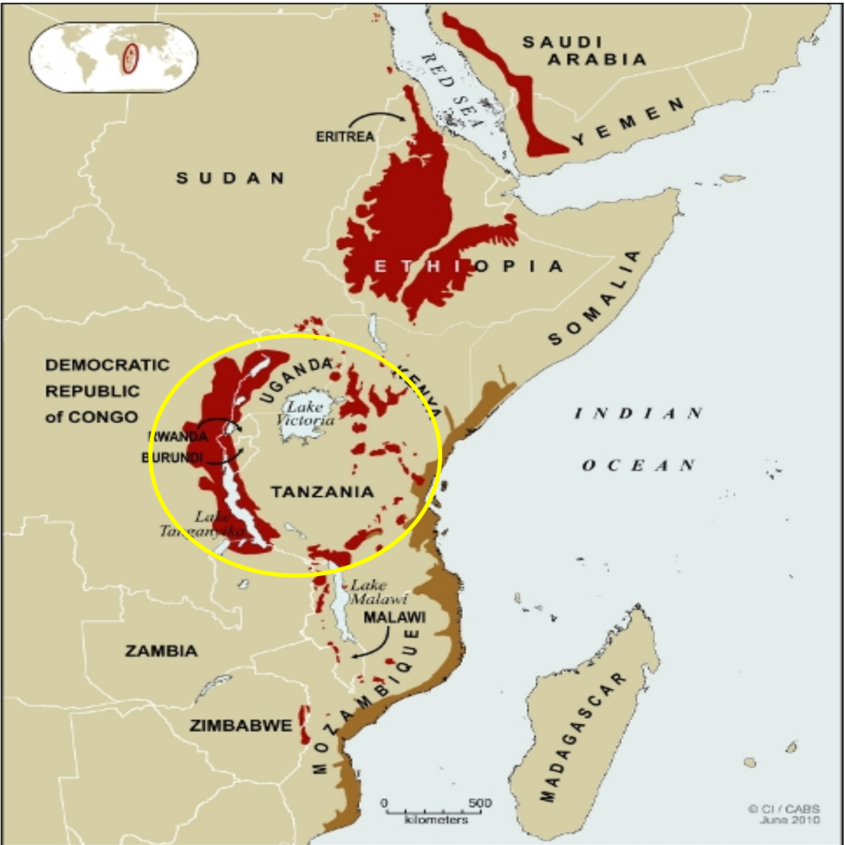
Figure 1. The Albertine Rift and Eastern Arc Mountains Sub-region (yellow circle) of the Eastern Afromontane Hotspot (red shading)