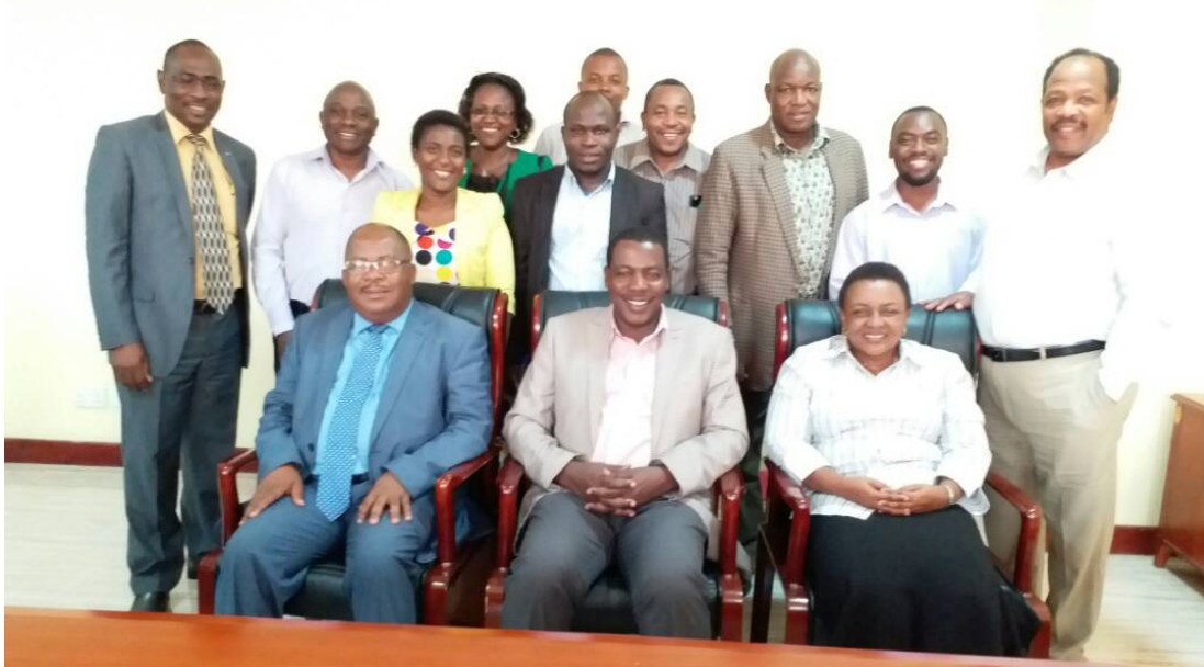
Participants during the consultation workshop in Dodoma, among them the Regional Commissioner (middle front) and Regional Administrative Secretary (left front) of Mara region