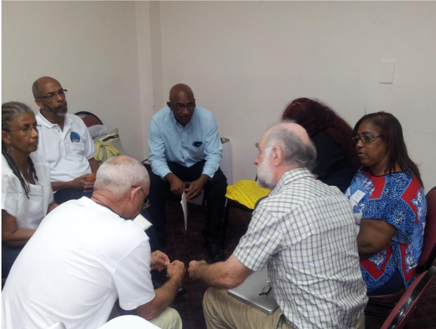
At left: Participants at the Jamaica workshops.