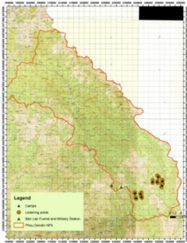
Figure 1: Phou Dendin National Protected Area and location of camps and listening posts visited at two sites.

Were any components unrealized? If so, how has this affected the overall impact of the project?