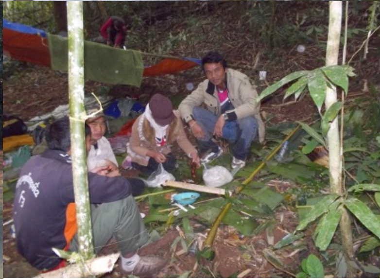
Gibbon survey team