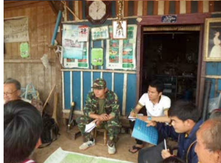
Meeting and interviewing villagers