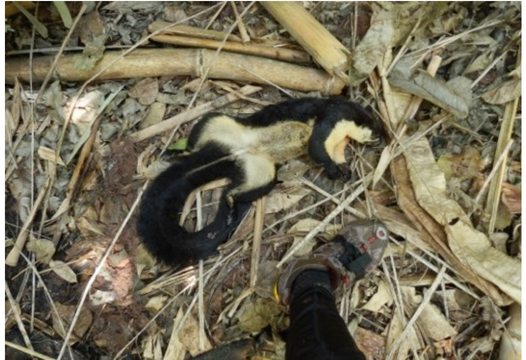
(Black giant squirrel ( Ratufa bicolor ) hunted by Vietnamese porchers)