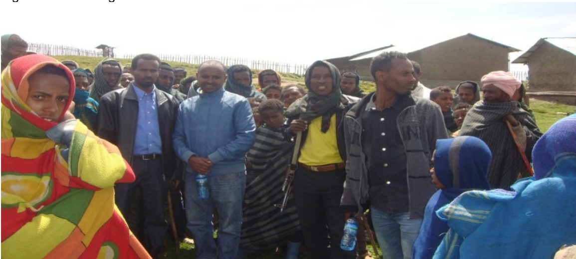
Figure 14 Meeting local shepherds and discussing about the values of Mount Guna