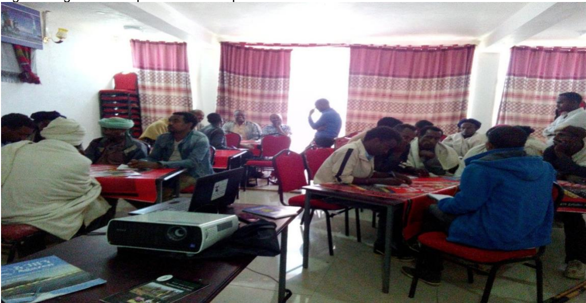
Figure 6 Trainees discussing on impacts of agricultural expansion near the tip of Mount Guna