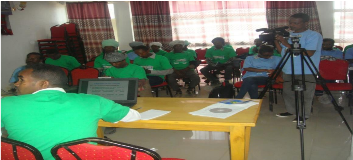
Figure 19 Trainees attending workshop on biodiversity conservation and ecotourism

The project team has again conducted a two-days capacity building workshop training (February 25-26, 2017) for mostly new local communities, government leaders from Soras and Mogesh Kebles, South Gondar Zone culture and tourism office, Fata district culture and tourism office, Debre Tabor University tourism and hotel management department, agriculture experts, travel agents (Gondar, Bahir Dar and Lalibela), Gasay and Kimer Dingay schools teachers on enhancing biodiversity conservation and sustainable community based ecotourism development in Mount Guna. Total participants were 46, of which 41 were men and the remaining 5 were female. The training was mainly focused on biodiversity and their values for the wellbeing of human being, threats to biodiversity, measures to tackle challenges of biodiversity conservation, identifying opportunities and challenges for community based ecotourism. All participants were actively participated and they confirmed that the designation of Mount Guna as “Guna Community Based Conservation Area” has been effective since the last eight months. They said that they have already started selling their livestock and waiting to be engaged in modern agricultural actives and other community based ecotourism opportunities.