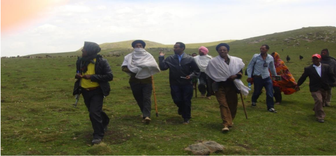
Figure 16 Moving away from local community confrontation in Mount Gun