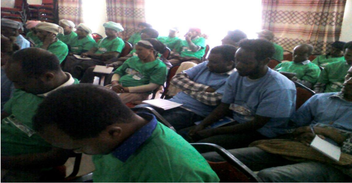
Figure 2 Trainees attending the 2 nd phase capacity building training workshop about Mount Guna. The training was mainly focused on biodiversity and their values for the wellbeing of human being, threats to biodiversity, measures to tackle challenges of biodiversity conservation, identifying opportunities and challenges for community based ecotourism development. All participants were actively participating and discussed on the above issues and reached common consensus on Guna community based conservation areas and introducing alternative livelihoods such as modern agriculture (fattening cattle, controlled grazing, trade, beekeeping, etc.) and community based ecotourism if infrastructures are well established (mainly, road and electricity). Mount Guna vulnerable situation has been discussed in several Kebele level, district level and zonal level. Finally, the community representatives reached agreement on the protection of the area. The participants confirmed that local communities have reached to an agreement on the designation of Mount Guna as "Guna Community Based Conservation Areas" as far as alternative livelihoods are facilitated and infrastructures are developed and expanded.