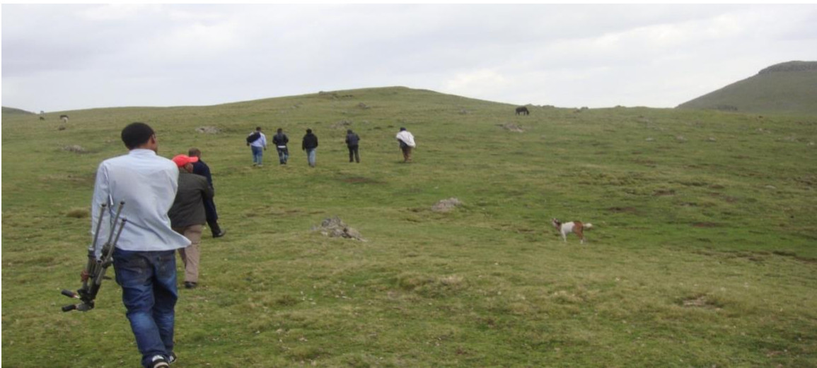
Figure 13 Traveling to Mount Guna with South Gondar administration zone media