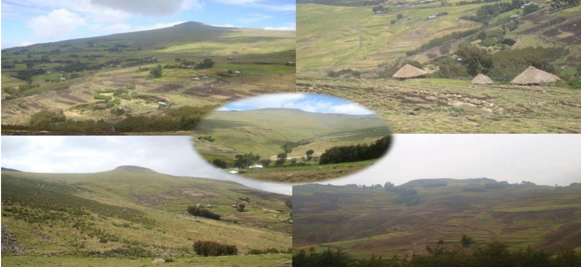
Figure 11 Settlement and agricultural expansion in Mogesh Keble

After two days capacity building training workshop, the project team organized familiarization field trip to Mount Guna for both trainees and trainers. During this field trip, the trainees promised to actively involved in any conservation activities that will be practiced. However, during the familiarization trip day, the local communities from Farta, East Etie and Lay Gaynt have mobilized their livestock up to the tips of Mount Guna after a week reservation to do so. Local communities were ready to confront anyone who claims their free grazing on Mount Guna and it was the training participants who faced the first community challenge. Nearly, all the local communities were fully armed and ready to clash who protect them from Mount Guna. Fortunately, South Gondar administrative zone arrived with policies and local militia to defend the visitors and community based conservation areas. Of course, it was sad to see a farmer has been shot during this confrontation and following this, there has been a continuous meeting and discussion with these local community to respect the designated community conservation areas and search alternative livelihoods.