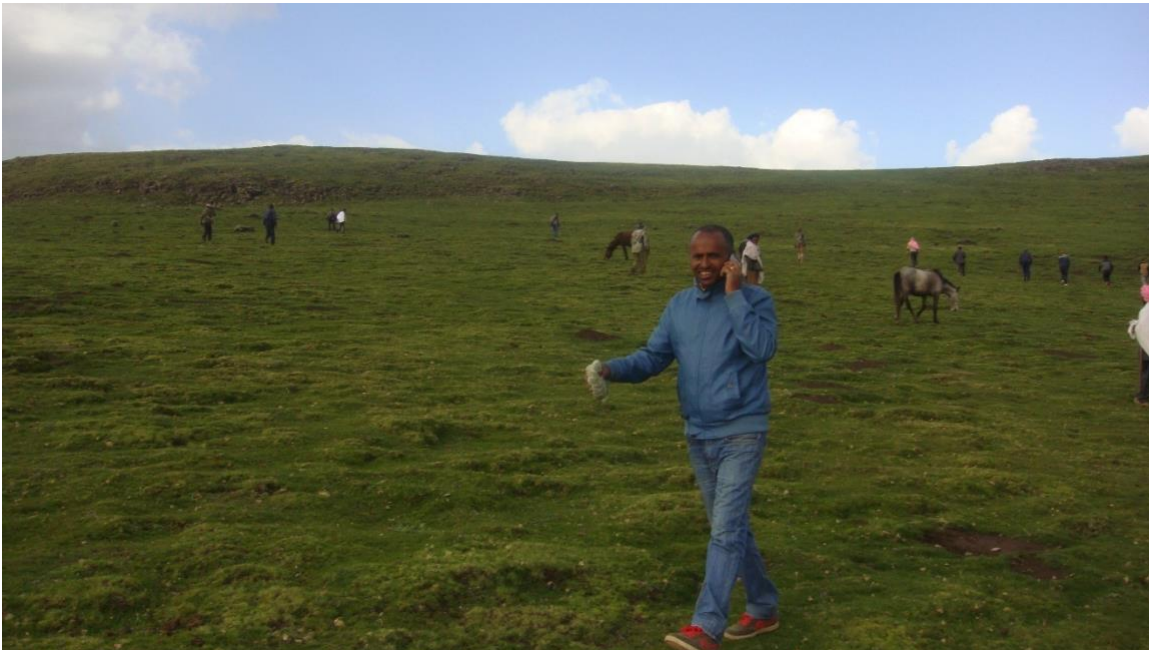
Figure 12 South Gondar administrative zone policies and local militia

After two days capacity building training workshop, the project team organized familiarization field trip to Mount Guna for both trainees and trainers. During this field trip, the trainees promised to actively involved in any conservation activities that will be practiced. However, during the familiarization trip day, the local communities from Farta, East Etie and Lay Gaynt have mobilized their livestock up to the tips of Mount Guna after a week reservation to do so. Local communities were ready to confront anyone who claims their free grazing on Mount Guna and it was the training participants who faced the first community challenge. Nearly, all the local communities were fully armed and ready to clash who protect them from Mount Guna. Fortunately, South Gondar administrative zone arrived with policies and local militia to defend the visitors and community based conservation areas. Of course, it was sad to see a farmer has been shot during this confrontation and following this, there has been a continuous meeting and discussion with these local community to respect the designated community conservation areas and search alternative livelihoods.