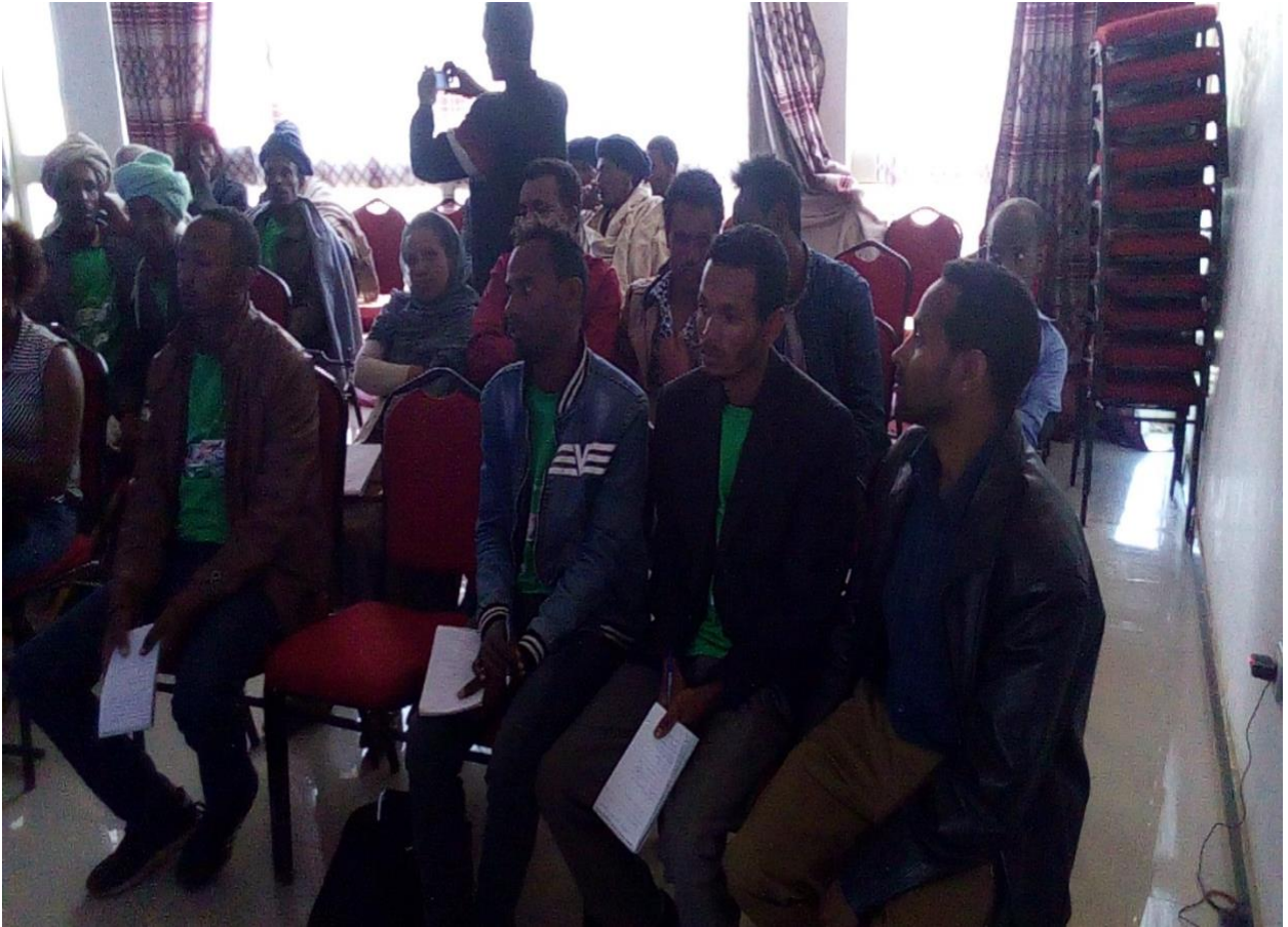
Figure 24 The way forward section of marketing and promotion