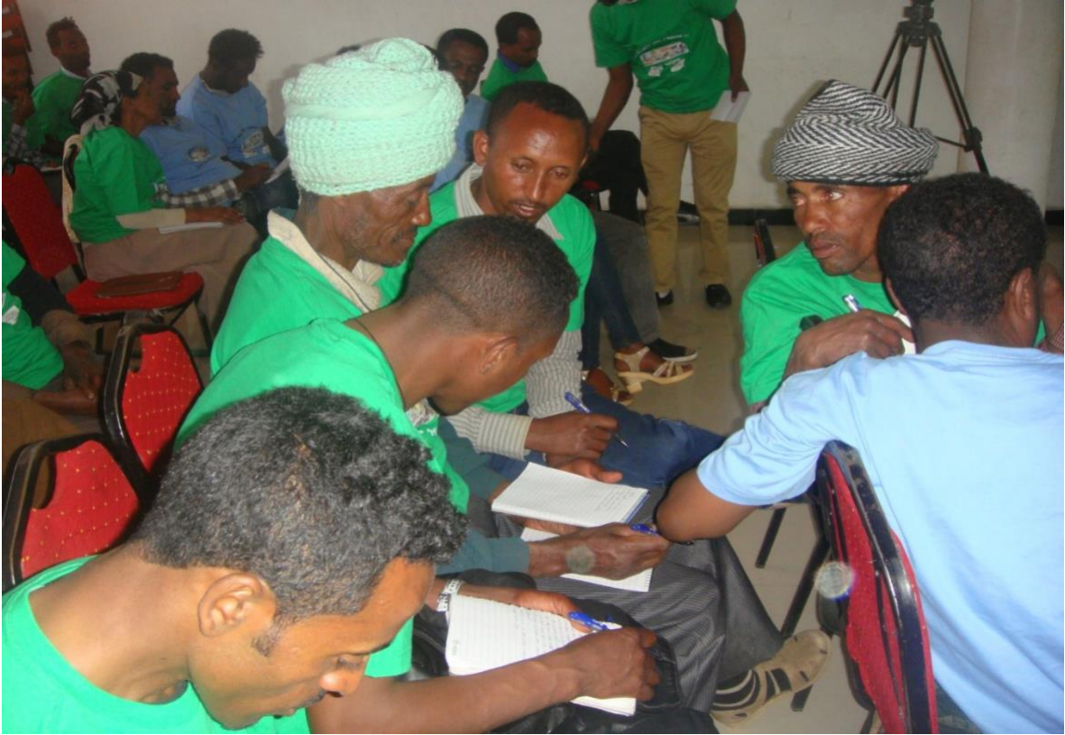
Figure 20 Trainees making discussion on challenges to proper utilization of biodiversity