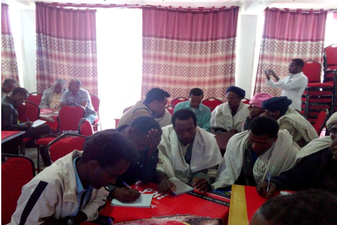
Figure 4 Trainees discussion on challenges to utilization of biodiversity

The following challenges discussed and summarized for sustainable biodiversity conservation: