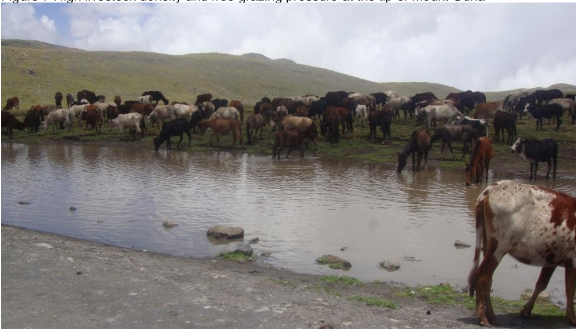
Figure 8 Traditional livestock put pressure on Mount Guna community conservation areas