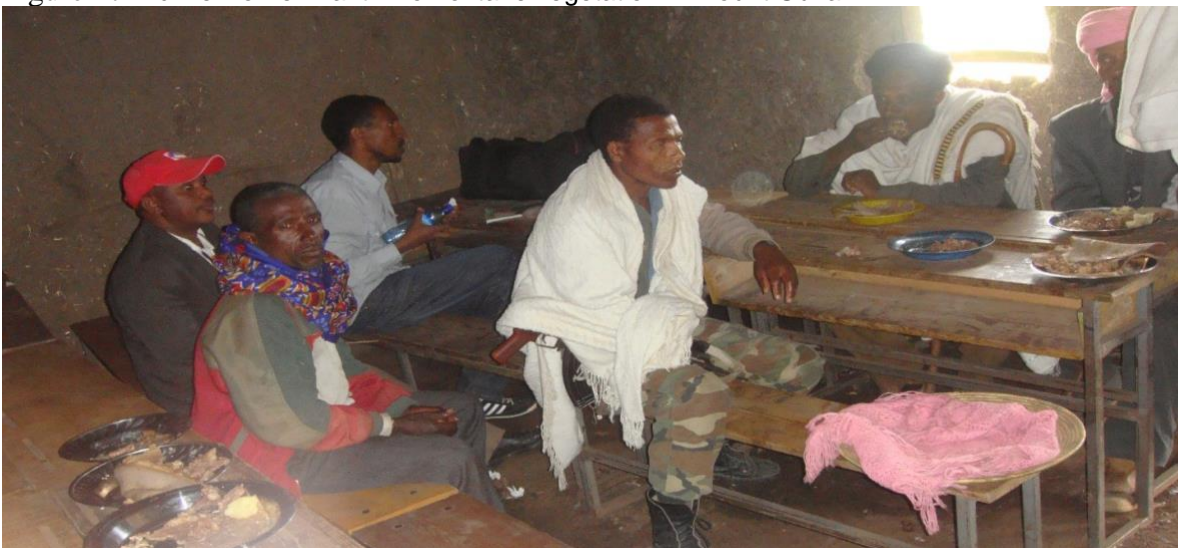
Figure 18 Visitors eating lunch in elementary school within Mount Guna