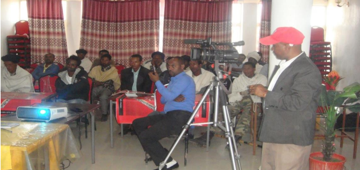
Figure 1 Trainees attending the 1 st phase capacity building training workshop about Mount Guna Local schools, local community representatives, University of Gondar, ORDA, ongoing projects, travel agents, culture and tourism offices were primarily approached and participated. The participants agreed to create local bylaws that allow local community to access Mount Guna biodiversity without imposing danger. The project has been conducting continuous marketing and promotion campaign through internet, local media, producing printed promotional materials, etc. For instance, the first round capacity building training workshop on biodiversity conservation and sustainable community based ecotourism was put on Amhara Television (ATV) on June 06, 2016 during evening news and June 07, 2016 on morning news. The project has conducted the first phase two-days capacity building workshop training (June 04, 2016 to June 05, 2016) for local communities, government leaders from Soras and Mogesh Kebles, South Gondar Zone culture and tourism office, Farta district culture and tourism office, Debre Tabor University tourism and hotel management department, ORDA, travel agents (Gondar, Bahir Dar and Lalibela), Gasay and Kimer Dingay Schools teachers on enhancing biodiversity conservation and sustainable community based ecotourism development in Mount Guna. The total participants for the first round training were 30 and all of them were men. The participants commented and agreed to be gender inclusive in the second round capacity building training workshop as women are more engaged in fuel wood collection, resources utilization, family responsibility and other burdens.