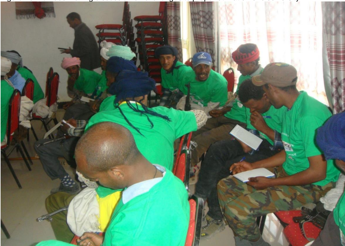
Figure 21 Trainees discussing on impacts of agricultural expansion at the tip of Mount Guna