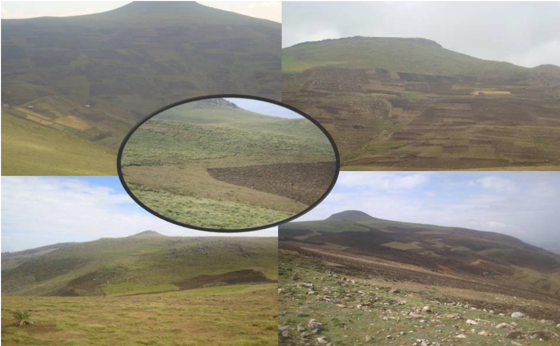
Figure 5 Agriculture expansion to the tip of Mount Guna in Elet Dibana and Dat Kebeles