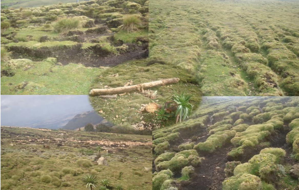
Figure 9 Land degradation due to deforestation and overgrazing