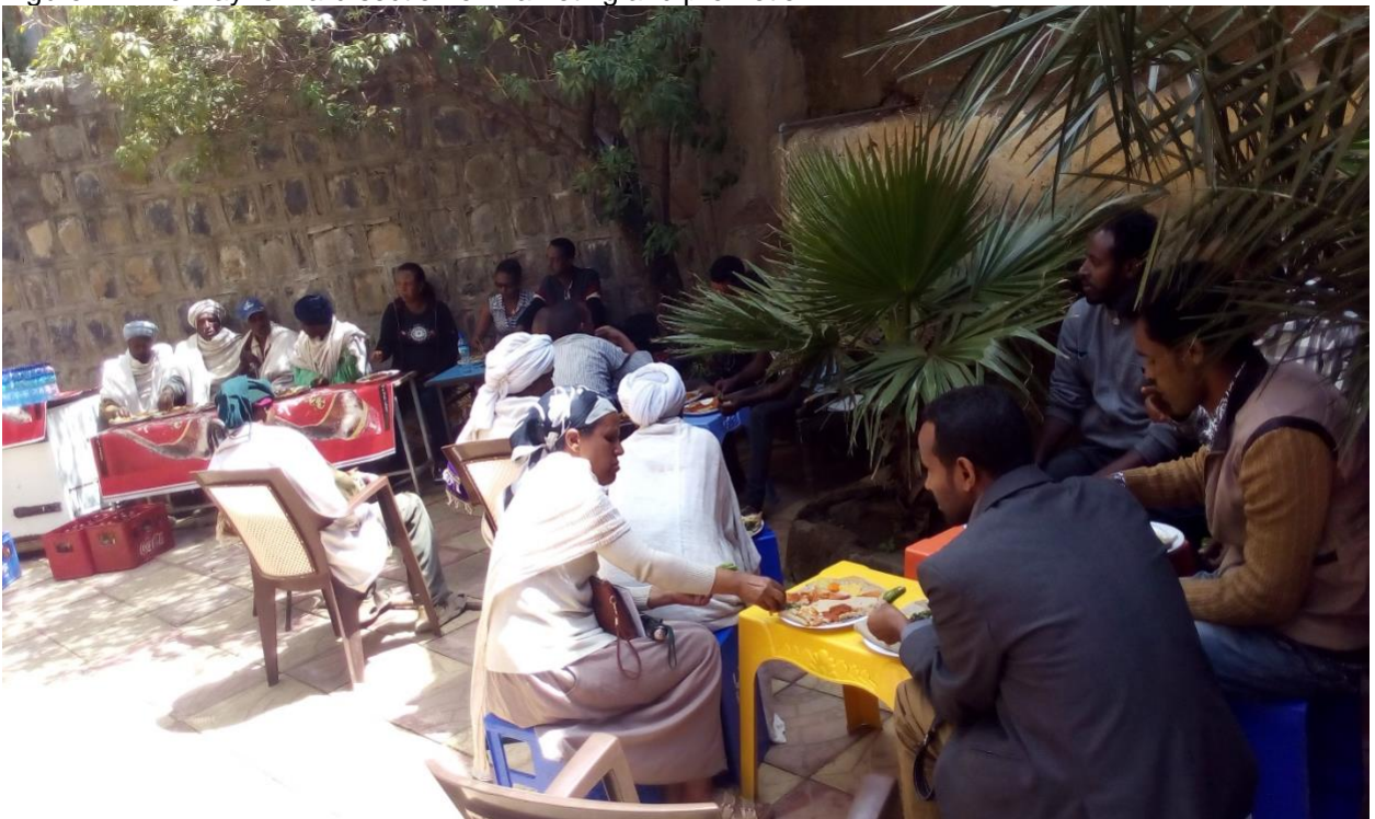
Figure 25 Visitors during lunch time at Debre Tabor