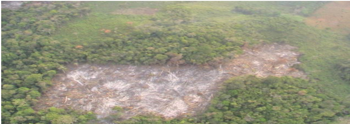
Illegal extraction, Chiquibul National Park, Belize.