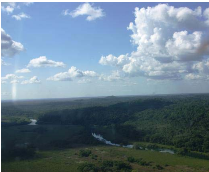
Mayan country, Guatemala.