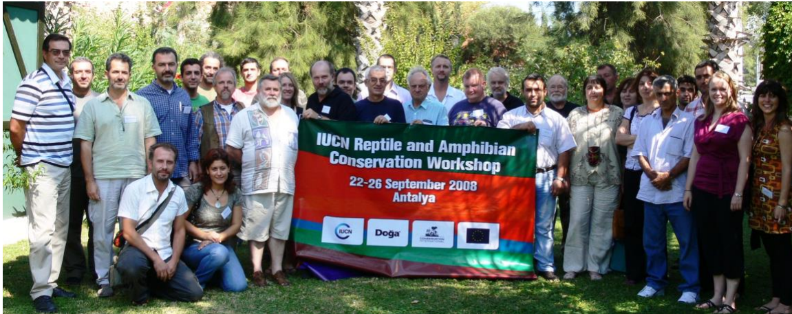
Participants of the September 2008 GRA workshop.

Experts were identified through consultative processes with Doğa Derneği and other important experts on the region. The workshop was attended by 24 participants in total; this included participants from Turkey, Armenia, Russia (including from the Caucasus), several European countries and two leading experts from the USA (see following photograph). Participants were able to share knowledge on each species during the formal working groups, and informally outside of the groups. The opportunity for participants to meet and discuss the conservation of reptiles within the Caucasus was greatly appreciated, and it is anticipated that this will allow greater overall collaboration.