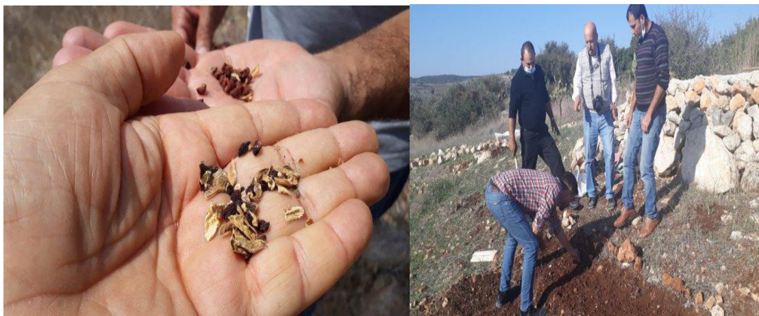
The seedling method