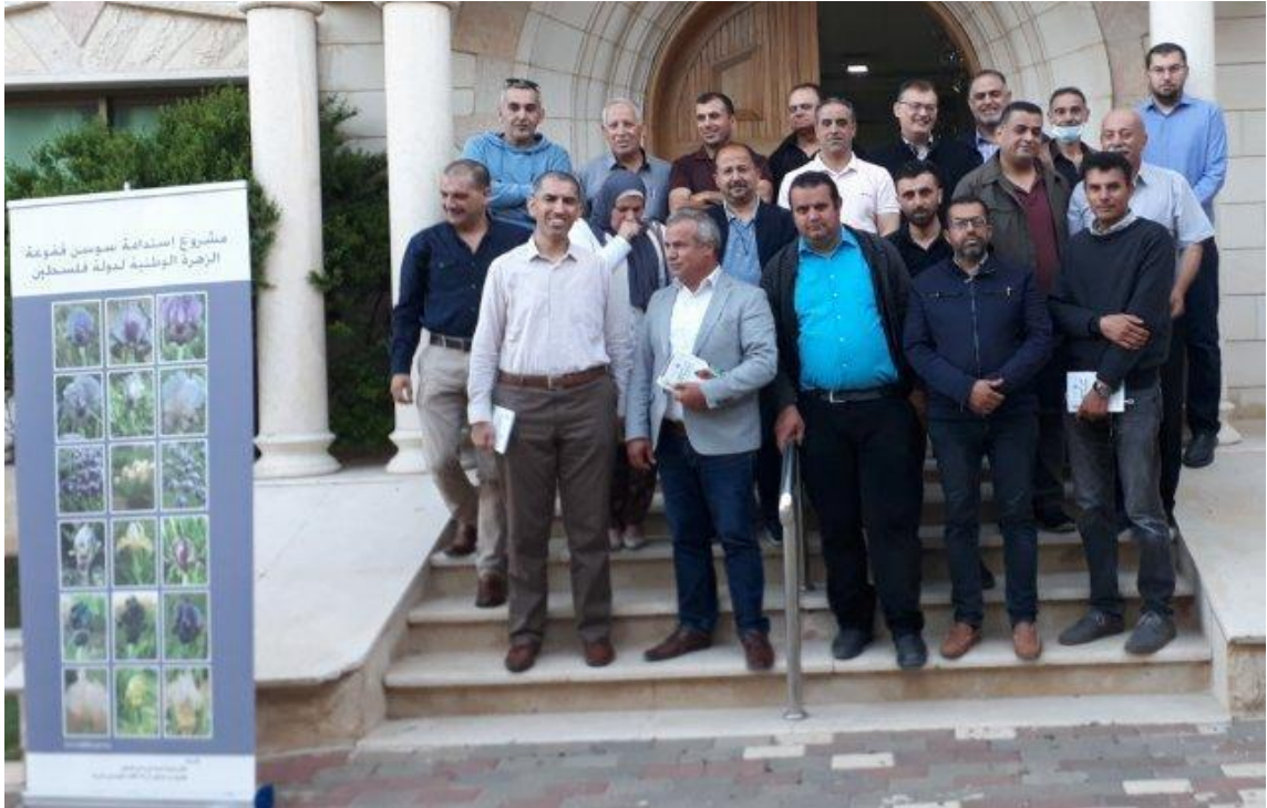
Final iris workshop in Jenin photo