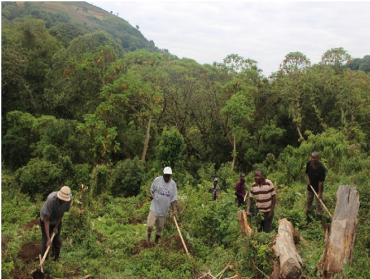
FIG 1 aerial view of 1.5 ha, fig 2 Ground inspection before restoration, fig 3 below spot-pitting, planting and current appearance of place at end of project 14 months after.