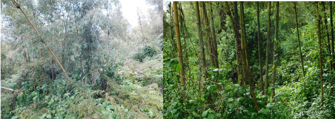
Figure 1 & 2 showing how the 30 hectares looked like. Bamboo before liberation characterized by scattered old bamboos 3- five years with climbers suffocating the shooting of new young bamboos.

30 hectares of colonized bamboos habitat has been liberated from invasive species which has resulted into bamboo regeneration of the previously bamboo depleted areas as a result of illegal harvesting. In addition, with CEPF grant, KIWOCEU supported collaborative forest management groups from Muko and Bufundi Sub County came up with conservation by-laws which have helped in minimizing illegal harvesting of bamboos, an action that has resulted into increase in bamboo vegetation cover on 30 hectares. 1.5 previously degraded areas which had no bamboo stands at all by the beginning of the project was restored with 1670 bamboo rhizomes 68% of which had started germinating. End of project evaluation indicated there was steady growth of new 5,654 bamboo shoots on planted clumps accounting for 29% vegetation cover increase 5,654 shoots by the end of the project.