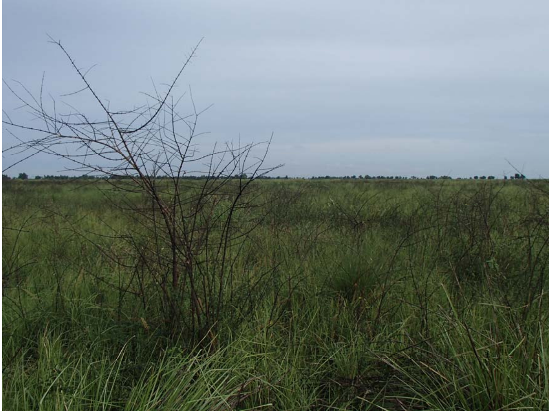
Figure 3. Grassland at Bakan, June 2013.

Based on data already discussed, the project identified various potential solutions to reconcile Bengal Florican conservation with development that fall either side of the land sparing-land sharing paradigm. As well as strengthening protection within Stoung–Chikraeng BFCAs (by far the most important site for Bengal Florican conservation based on both numbers of floricans and, especially, density of displaying males) the project evaluated the following approaches to expanding the scope of Bengal Florican conservation in the floodplain: