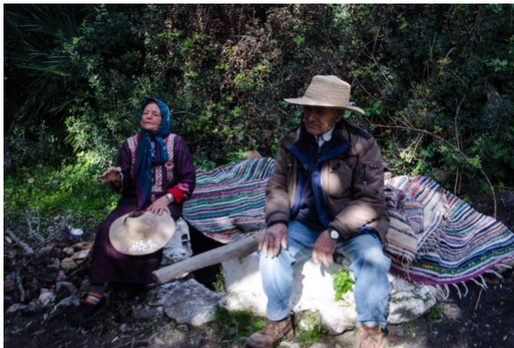
Demonstration of the Hamem to the Medicinal plants

The group was hosted in two guest houses Haouaria: Villa Dar Ennesema and Zembra.