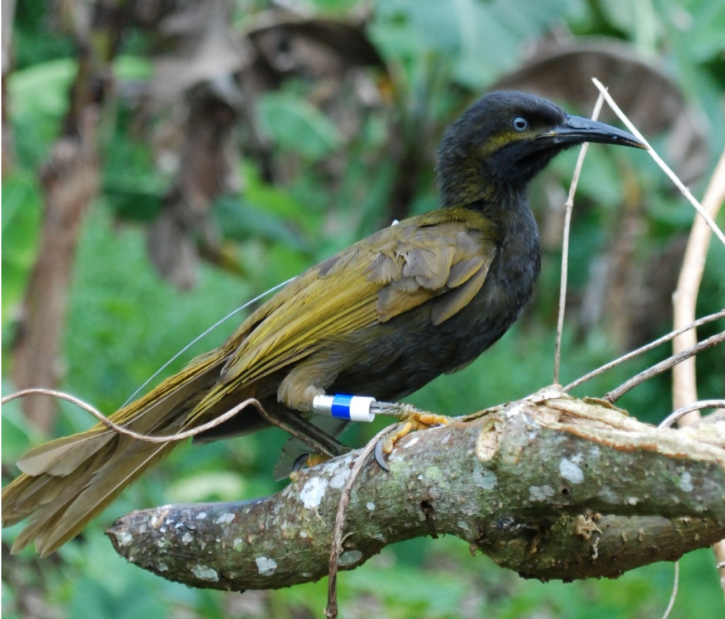
Adult Ma'oma'o colour banded and fitted with transmitter