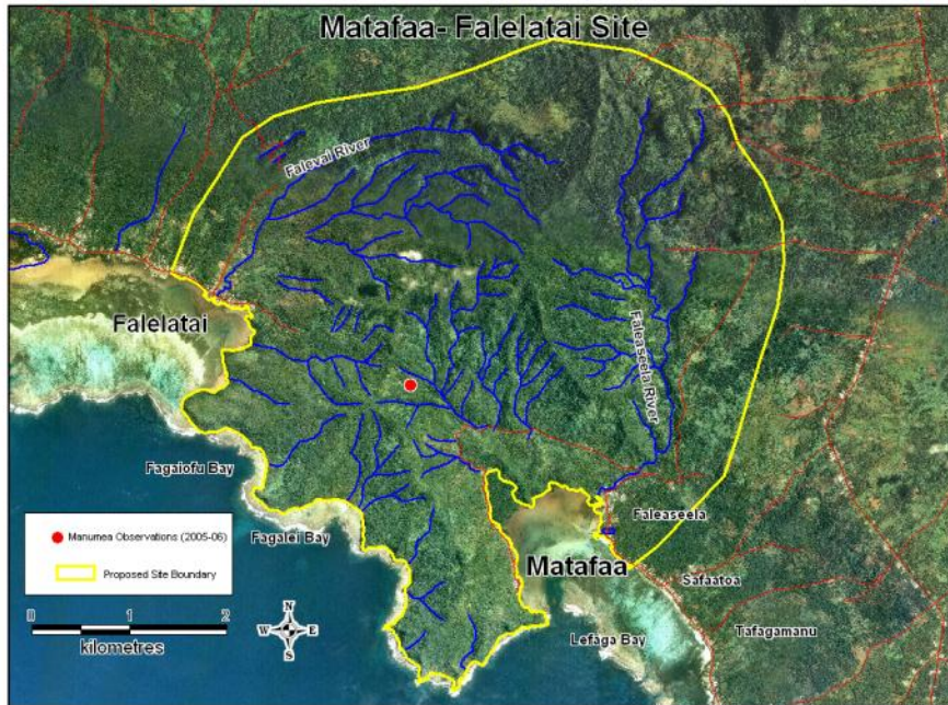
Map of Matalafa'a key site

In May 2012 a bird survey was carried out of a fourth key area, the uplands of Savaii, within another CEPF-funded project managed by SPREP. Two four-person teams visited a variety of sites over a 2-week period and obtained only a single uncorroborated sighting of a manumea by one individual. No calls that could definitely be assigned to this species were heard. One of the teams also spent a day in a fifth area, Aopo Lowlands with no result. Information was also forthcoming that the species can no longer be regularly observed at a sixth site, Tafua Peninsula.