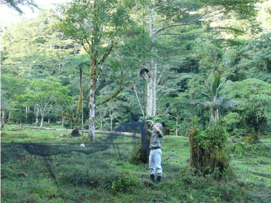
Les Moran setting up mist net in Magiagi study area

The second study site was located near Lake Lanotoo at S13^{\circ}90.817, W171^{\circ}80.645 at approximately an elevation of 700m. This site encompasses steep ridges and steep slopes which still retain dense forest and a large flat valley where some clearing of the understory for agriculture has occurred but where large native trees still remain.