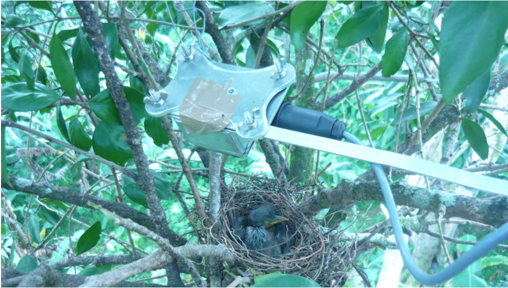
Ma'oma'o chick in nest fitted with remote camera

Observations from nests that fledged young suggest the egg takes +19 days until hatching, and chicks fledge approximately 21-22 days later. So the period in the nest is approximately 40+ days from hatching to fledging. A juvenile is dependent on the adult for an additional 2-2.5 months post-fledging during which it remains in the adult birds' territory.