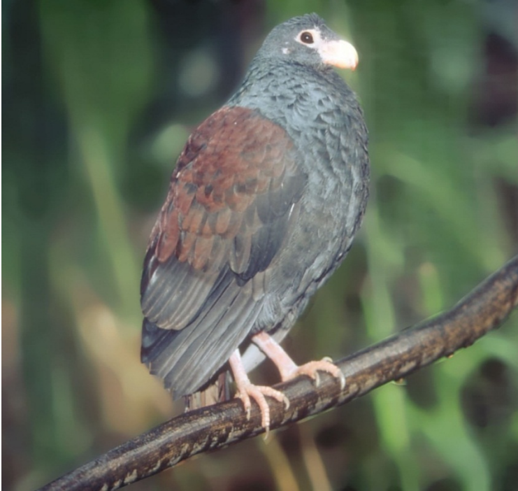
Adult manumea in captivity