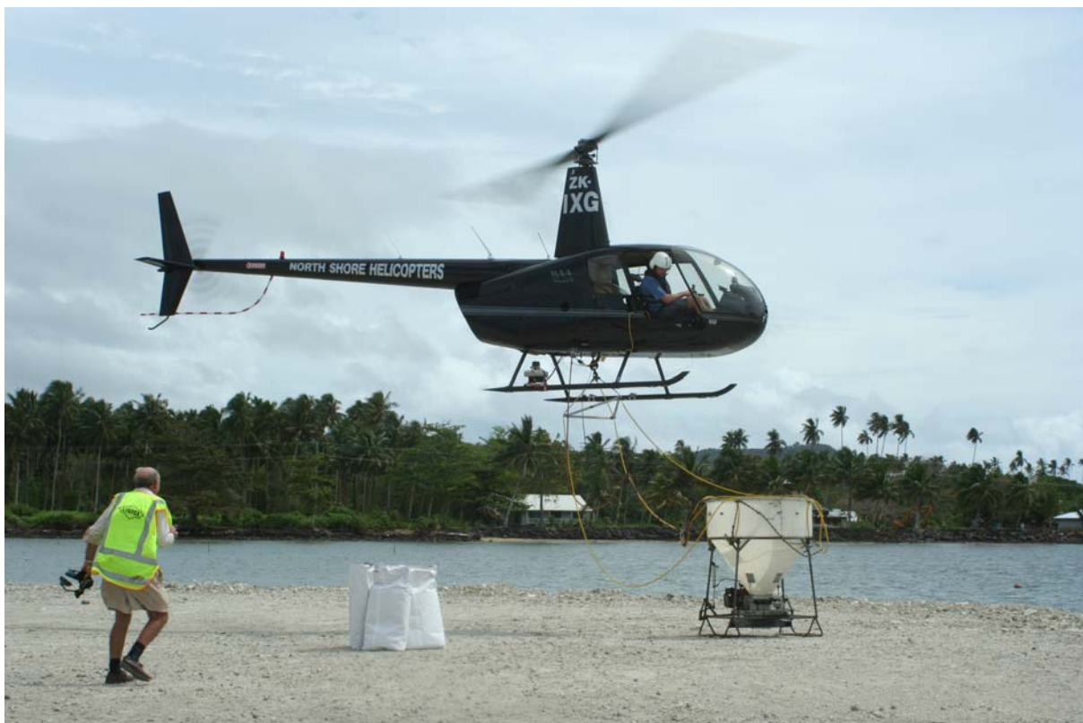
Figure 2. Robinson 44 helicopter, pilot Paul Trapski, with bait spreader bucket ready for loading, all supplied by Northshore Helicopters, New Zealand.

Once funding was approved and the two companies were asked for a quote, the Fiji one was ruled out as it could no longer supply a suitable helicopter until October. By the time another quote was obtained to satisfy CEPF requirements, there was a very tight time-frame to finalise contracts with Northshore and arrange shipping of a helicopter and spreader bucket from New Zealand (Fig. 2). This time-frame was one factor behind subsequent difficulties with the aerial drops.