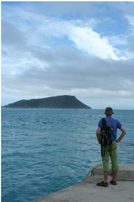
Figure 1. Nu'utele Island, as seen from the nearby shore of Upolu, shortest distance 1.3 km. Nu'ulua lies behind Nu'utele, 3.3 km from Upolu.

become a refuge include the Tooth-billed Pigeon Didunculus strigirostris , Ma'oma'o Gymnomyza samoensis , Island Thrush Turdus poliocephalus and Samoan White-eye Zosterops samoensis , while other organisms such as land-snails and native plants should also benefit from restoration. No burrow-nesting seabirds remained on the islands and it is likely that these were killed off by rats. They may return subsequent to rat eradication, or may require re-introduction or further intervention to encourage their re-colonization. The islands thus have the potential to play a key role in sustaining the future of Samoa's biodiversity.