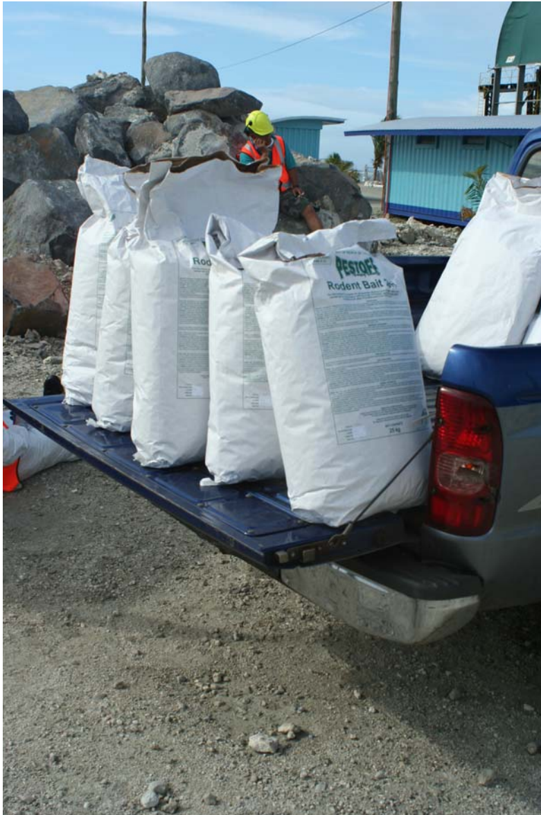
Figure 3. Brodifacoum bait awaiting loading into bait spreader.

Shipment and storage of baits went smoothly under ACP's guidance. Six pallets of 20-kg bags of bait (Fig. 3) were shipped in a container with a black condensation sheet hanging on the inside. The door of the container was opened during the day and closed at night every few days while it was in storage in Samoa, to optimize storage conditions. Shrink wrap was left on the pallets until the operation, as there was no sign of condensation.