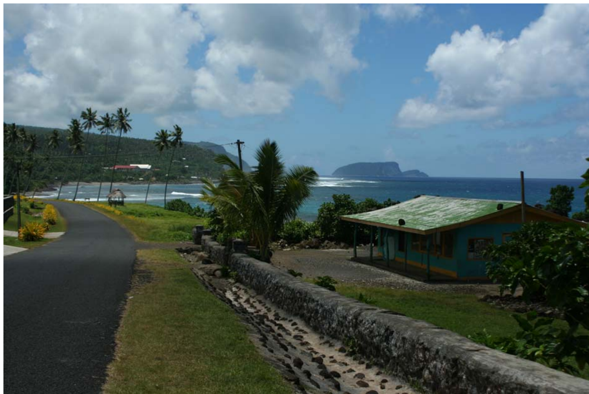
Nu'utele and Nu'ulua Islands on the horizon, seen from the south coast of Upolu Island, Samoa.

Project Dates: 1 May 2009 to 31 Dec 2011.