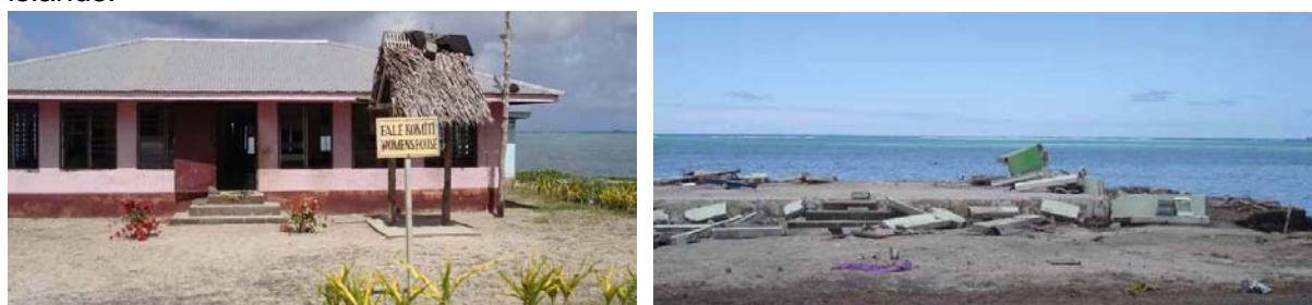
Figure 8. Ulutogia Women's Committee Centre, 22 November 2005 and 2 October 2009. Nu'utele and Nu'ulua are off the frame to the right.

The tsunami was a possible cause of the rats now found on Nu'utele, as much debris was washed up on Vini Beach (see Figs 8 and 9). Lines of bait stations with wax baits and traps were set up on Vini Beach in January 2010 and on Nu'utele Beach in March 2010. Such devices have not yet been set up on Nu'ulua owing to problems of access. Nu'ulua can only be reached if seas are relatively calm and the consequent low rate of visitation by boats is one of its key defences against re-invasion by rats. It has not been possible for MNRE to establish regular monitoring or a rapid-response system for the islands. This should be a major concern for any future eradication plans, whether of rats or any other pest on the islands.