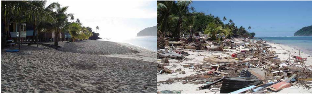
Figure 9. Lalomanu looking east, 10 December 2005 and 2 October 2009. Namu'a Island is visible on the right, with Nu'utele and Nu'ulua further off the frame to the right.