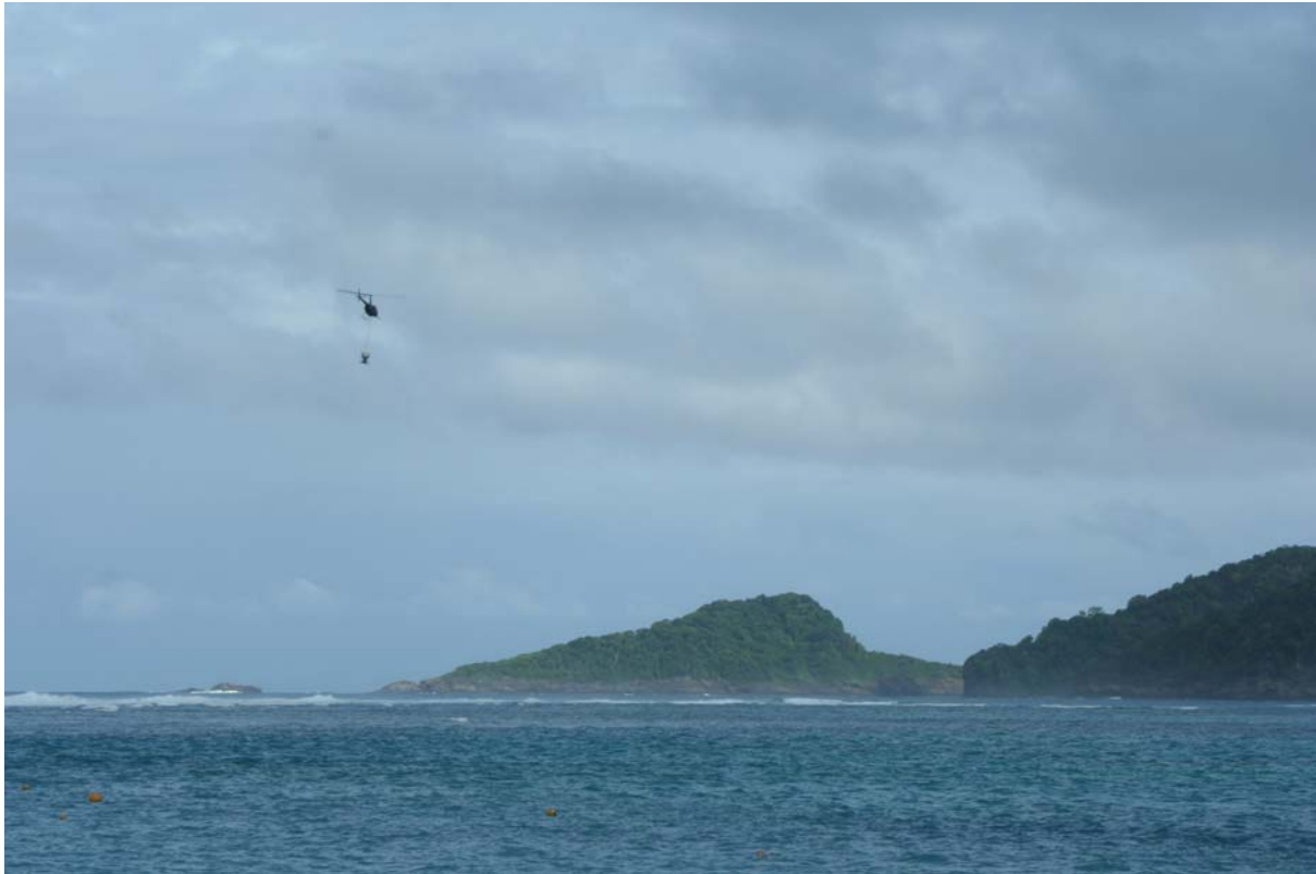
Figure 4. Helicopter heading from the operation site on Upolu to the islands, with loaded bait spreader. Nu'ulua is the further island in the centre of the photo, with Nu'utele to the right.