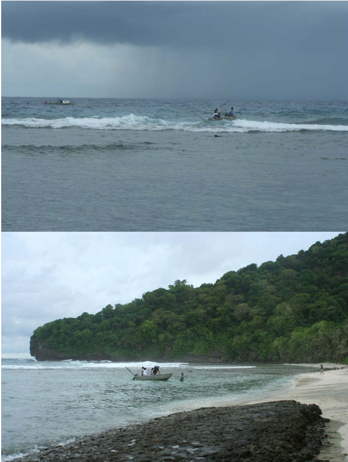
Figure 7. Landing for a monitoring visit, on Nu'utele Beach, east side of Nu'utele Island.

after the operation, and at intervals thereafter (Fig. 7). So far, up to three monitoring phases have been completed, for different ecosystem components, as described below.