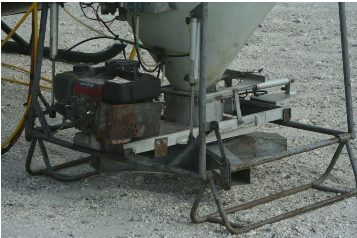
Figure 5. The bait spreader mechanism, with drive motor on the left.