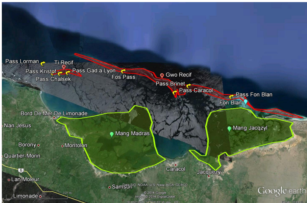
Mangroves: Mungwov Madras, Mungwov Jacqzyl

As expected the primary areas for fisheries were in relatively deeper waters in the fore reef area (from the reef out into open water). There was little fishing performed within the mangroves primarily due to the shallowness of the water in these areas. However, the diurnal use of small mesh seine nets along the perimeter of the mangroves remains a major concern in terms of damaging fishing techniques.