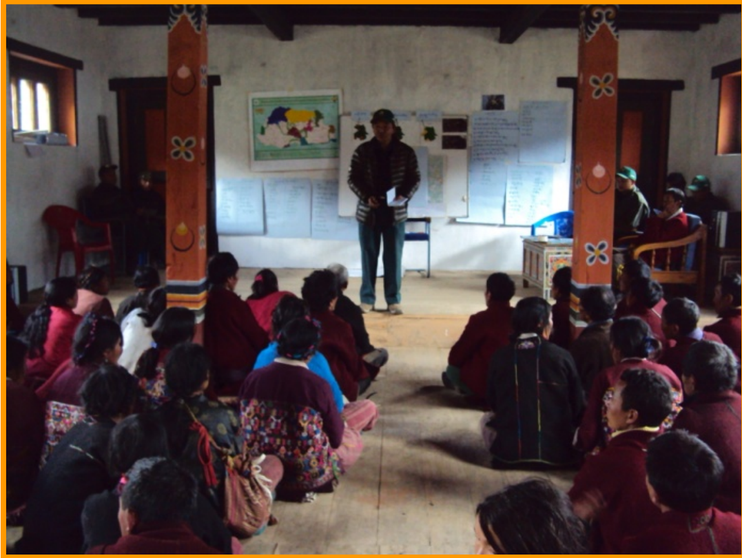
Consultation meeting in one of the gewogs