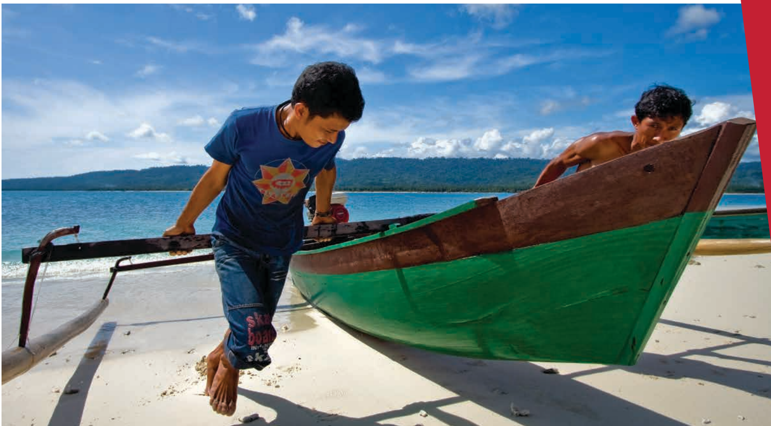
Men haul a canoe onto a beach in Central Sulawesi.

CEPF's investment in Wallacea is guided by an investment strategy, known as an “ecosystem profile.” The ecosystem profile presents a situational analysis of the context for biodiversity conservation in the region, framing an investment strategy for CEPF and other funders interested in strengthening and engaging civil society in conservation efforts in the hotspot. In this way, the ecosystem profile offers a blueprint for coordinated conservation efforts in the hotspot and cooperation within the donor community.