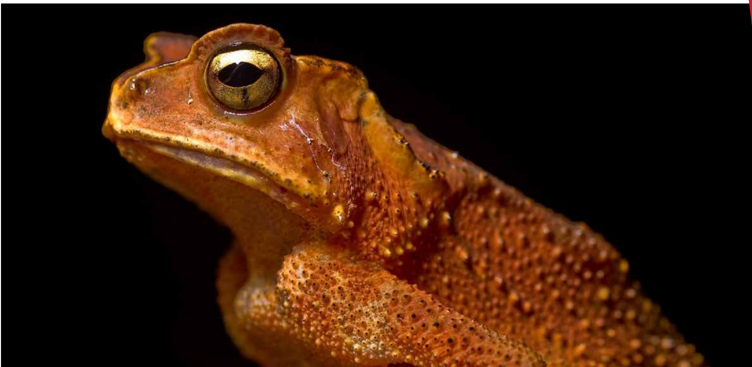
Sulawesi toad ( Ingerophrynus celebensis ).

The niche for CEPF investment in the hotspot was defined through an extensive process of stakeholder consultation, supported by a detailed analysis of gaps and trends in conservation investment. The CEPF niche is to support a diversity of civil society organizations with varying levels of capacity to achieve conservation outcomes and environmental sustainability within the increasingly important national agendas of economic growth.