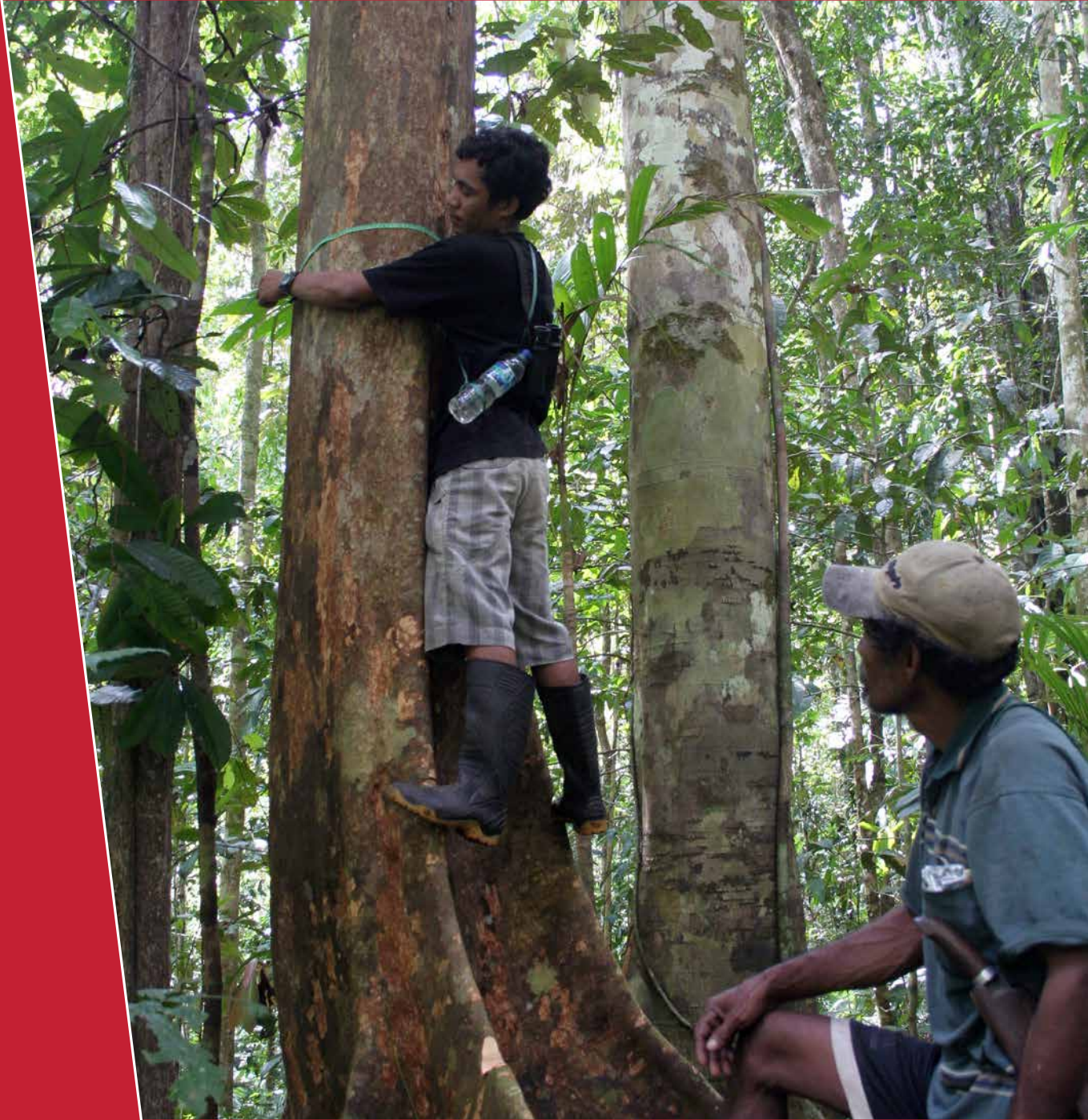
Vegetation survey at Tayawi Forest, Halmahera, North Maluku Province, Indonesia.