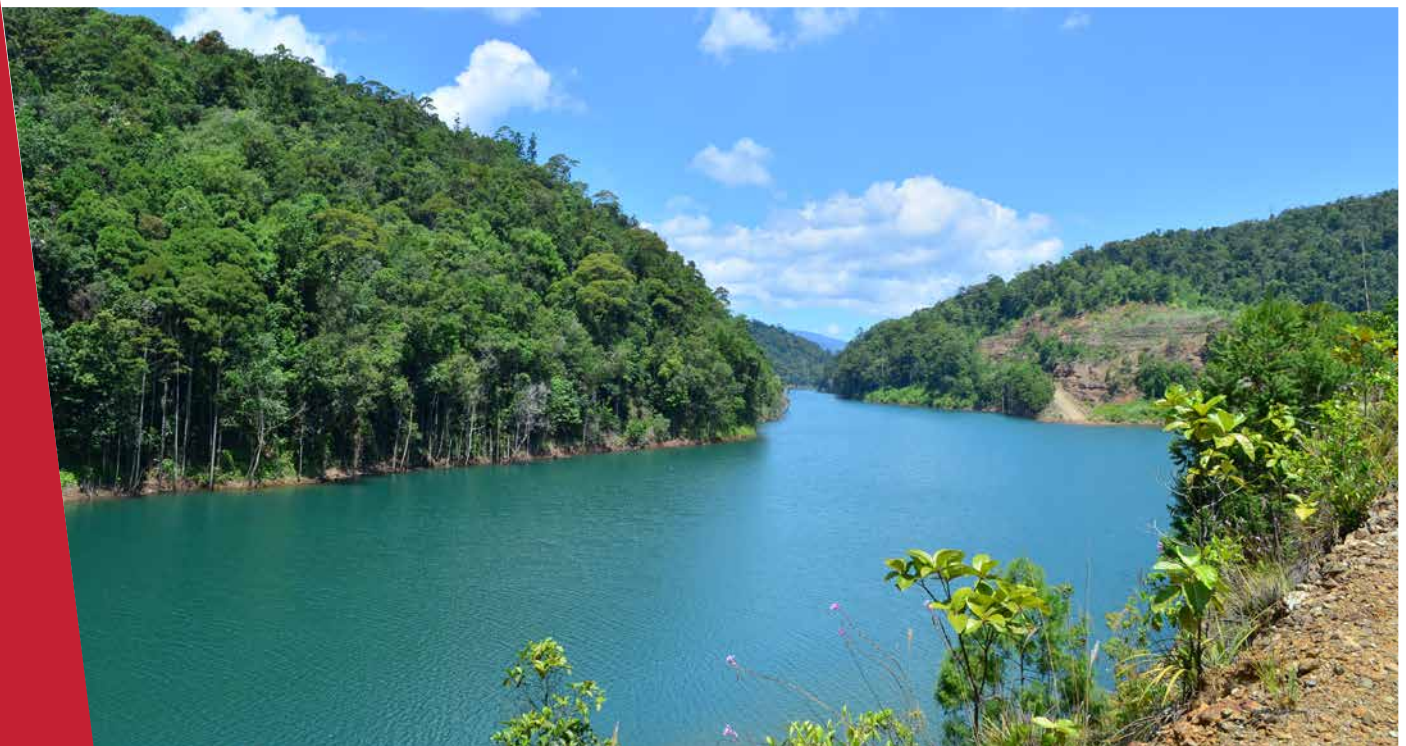
Sorowako, South Sulawesi Province, Indonesia.

Further, increases in temperature, and temperature differences between land and sea, will cause stronger winds and larger waves, making life harder for local fishermen. New temperature patterns will also change the distribution of malaria-spreading mosquitoes, while increased rainfall, with Wallacea's steep topographies and friable (crumbly) soils, will lead to landslides, blocking roads and damaging farmland and property. High rainfall will increase the spread of the bacterial leaf blight in rice—particularly on the islands of Timor and Sumba, and in South Sulawesi and Central Maluku—while maize in Timor-Leste will be vulnerable to drought. The production of coffee, Timor-Leste's most important export crop, will likely move upslope, bringing farmers into conflict with forest conservation.