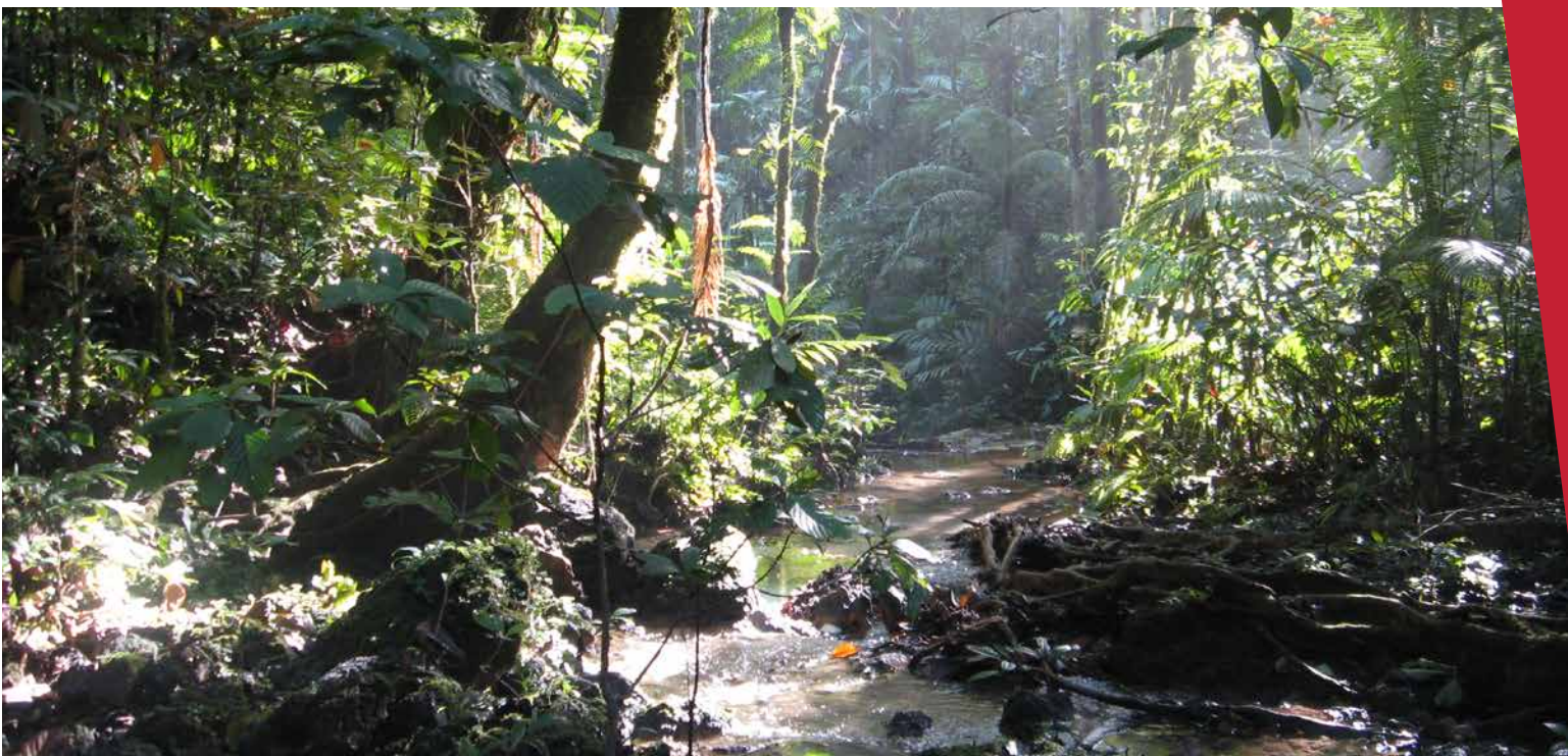
Aketajawe Lolobata National Park, Halmahera, North Maluku Province, Indonesia.

Domestic civil society organizations and local communities have responded to the conservation issues they face with a range of strategies, often founded on traditional customs and governance arrangements. For these groups to be successful, they require greater capacity, as do the groups that give them technical support. Local groups, NGOs and governments also need the ability to monitor and communicate to ensure that they deliver on their overlapping but different goals in relation to the underlying ecosystem. Moreover, there is a need to integrate the goals of conservation areas into plans and policies of other sectors so that they are not undermined by incompatible developments.