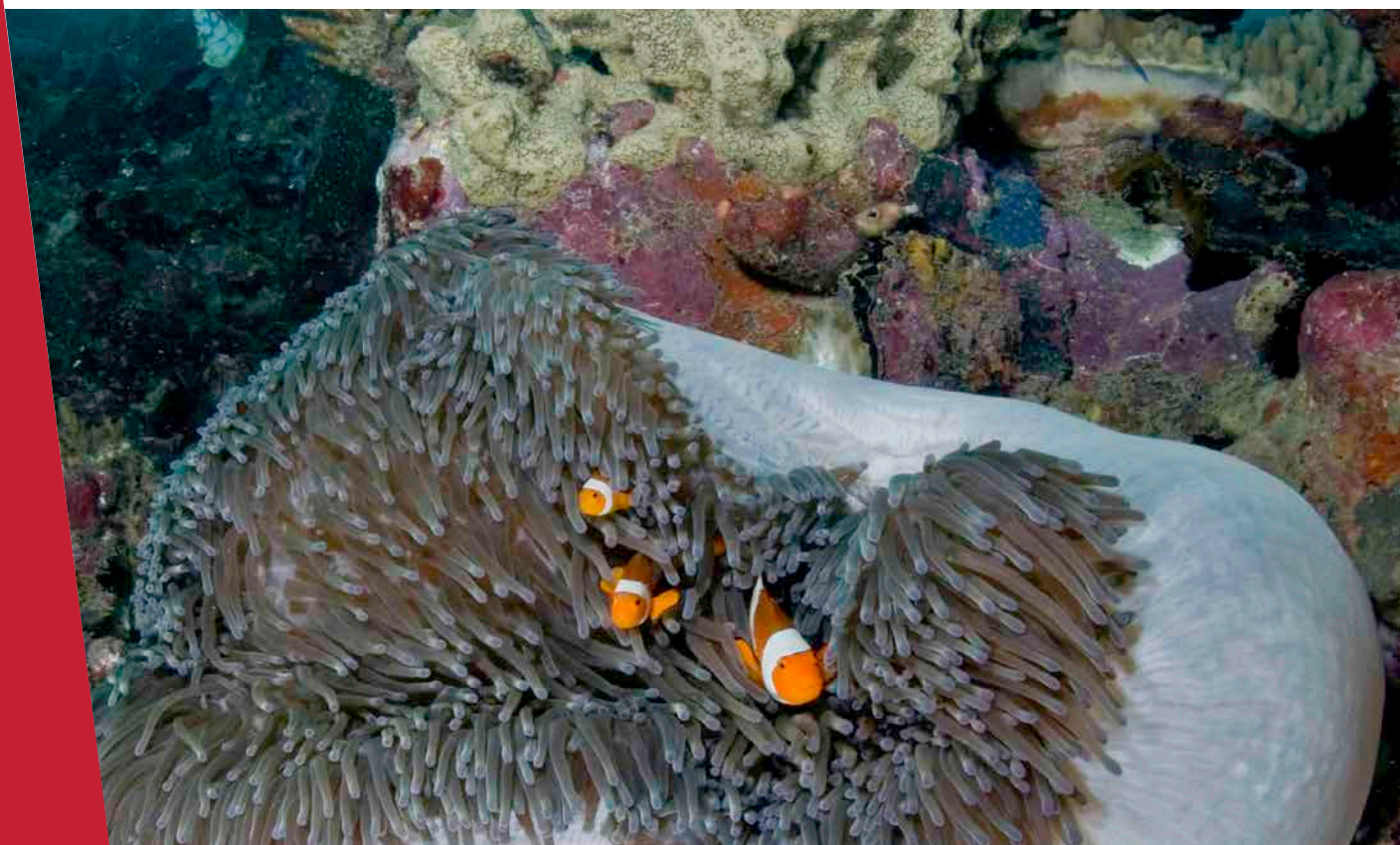
False clown anemonefish ( Amphiprion ocellaris ), Halmahera, North Maluku Province, Indonesia.

In addition, 22 terrestrial species and 23 marine species have been prioritized from among the full list of globally threatened species in the hotspot. The purpose of selecting priority species is to support actions where species conservation cannot adequately be addressed by habitat protection alone. In most cases, the additional action needed is control of overexploitation.