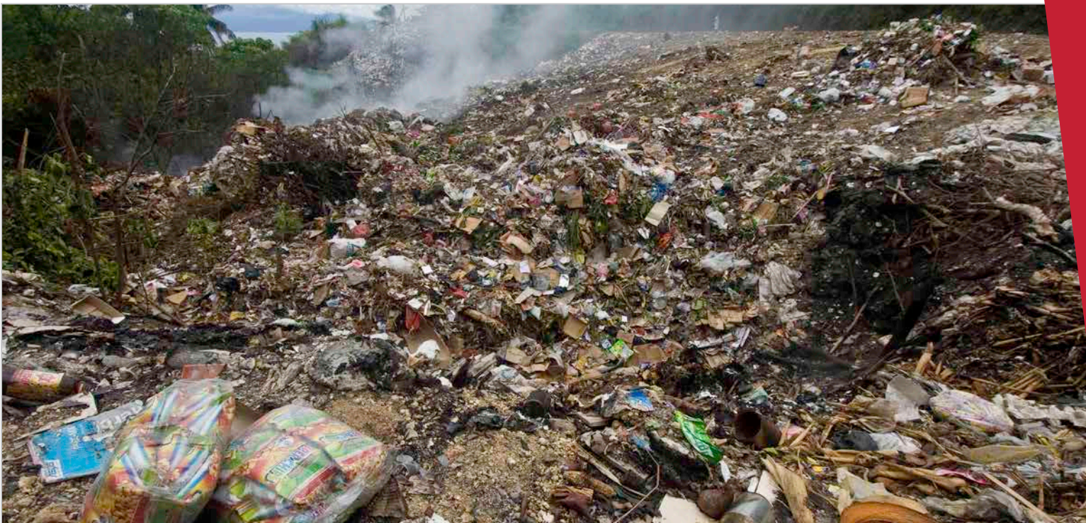
Piles of trash smolder by the side of the road in Central Sulawesi, Indonesia.

Constraints to effective protection of the environment include capacity limitations among government and civil society, poor integration of environmental issues into regional development planning, poor understanding of environmental issues among the general population, and lack of information on biodiversity. CEPF will address these constraints, root causes of biodiversity loss, and direct threats to critical sites in Wallacea.