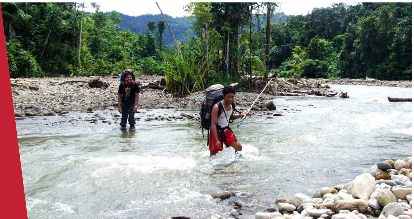
Tayawi River Halmahera, North Maluku Province, Indonesia.

KBAs are the starting point for defining landscape-level targets, or conservation corridors. These are defined where it is necessary to maintain or establish ecological connectivity in order to maintain evolutionary and ecological processes or meet the long-term needs of landscape species. Ten landscapes have been defined, covering a total land area of 14.4 million hectares or 45 percent of the total land area of the hotspot.