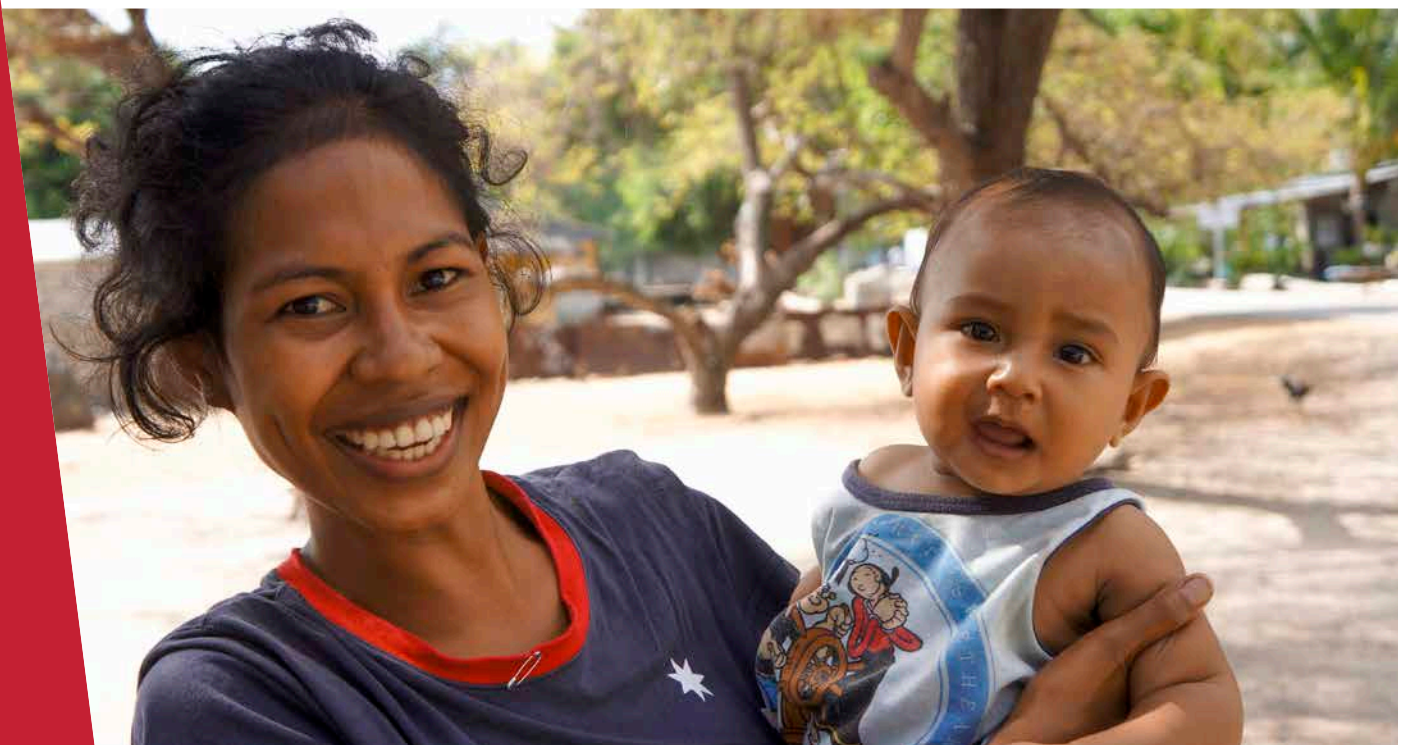
Mother and child, Timor Leste.

In the region overall, marine program funding is concentrated through a coordinated approach by several foundations in the Lesser Sundas and Banda seascapes, and funding for terrestrial programs is focused in parts of Sulawesi. Thus, funding from CEPF is designed to fill a crucial niche for supporting conservation.