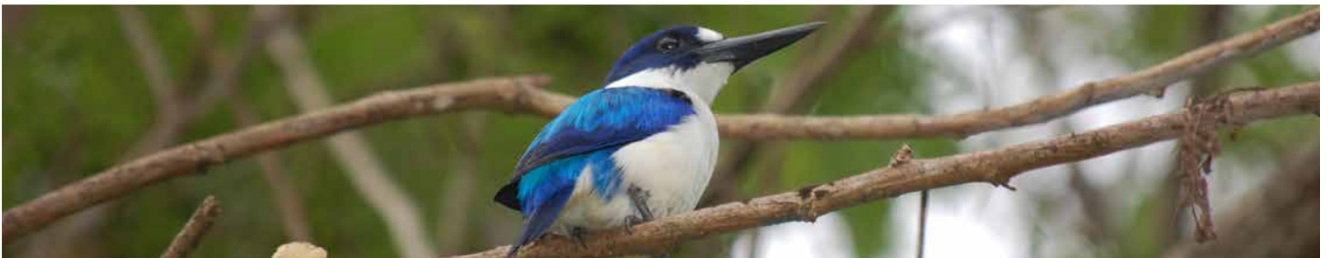
A blue-and-white kingfisher ( Todiramphus diops ), Aketajawe Lolobata National Park, Halmahera, North Maluku Province, Indonesia.