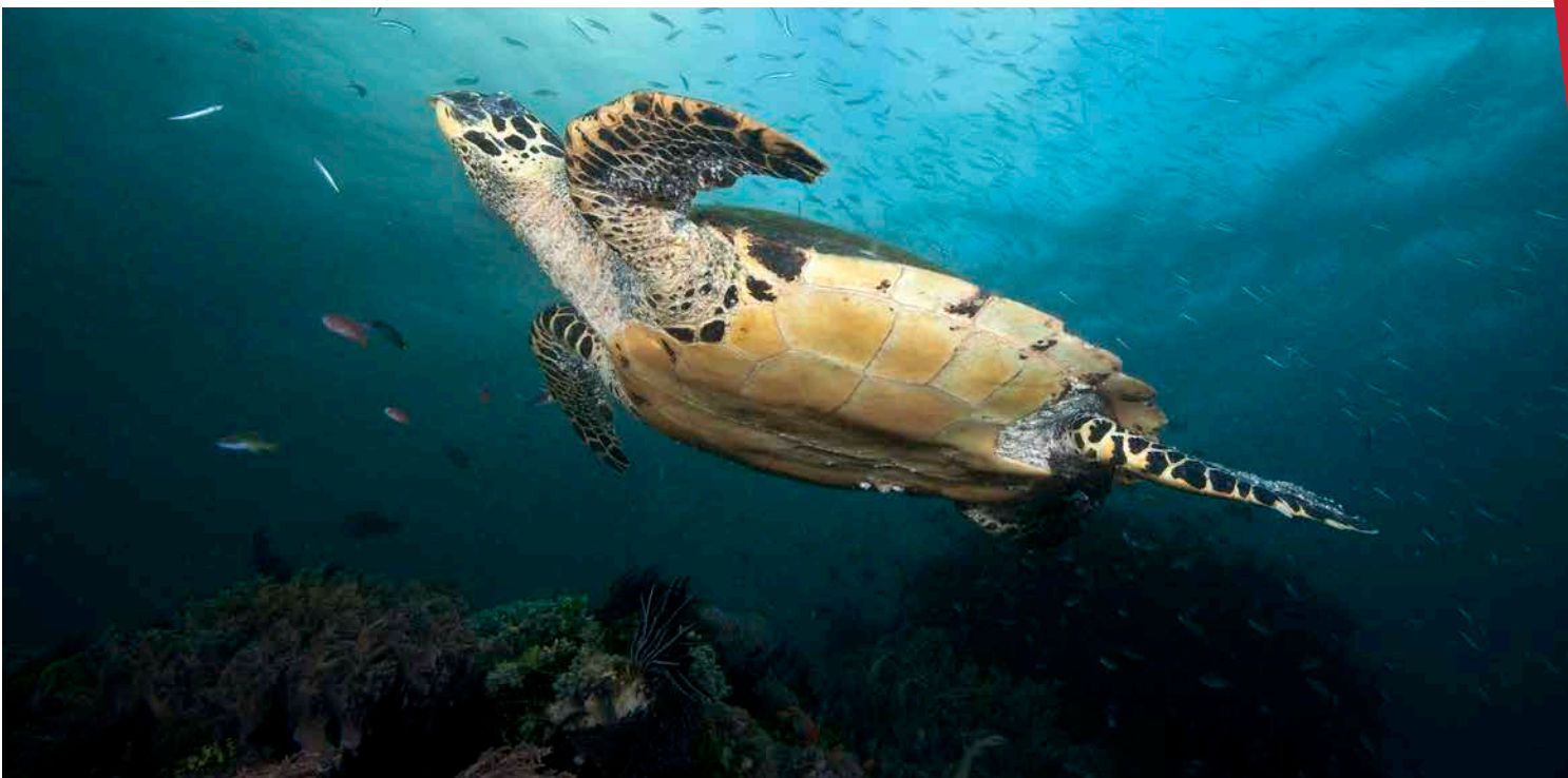
A hawksbill turtle glides above a reef, Komodo National Park, East Nusa Tenggara, Indonesia.

Marine conservation is of equal importance—Wallacea lies within the Coral Triangle, a region that supports 75 percent of known coral species and an estimated 3,000 species of reef fishes. Thus, the geographic scope of the hotspot is considered to include near-shore marine habitats, such as coral reefs and seagrass beds, in addition to terrestrial habitats.