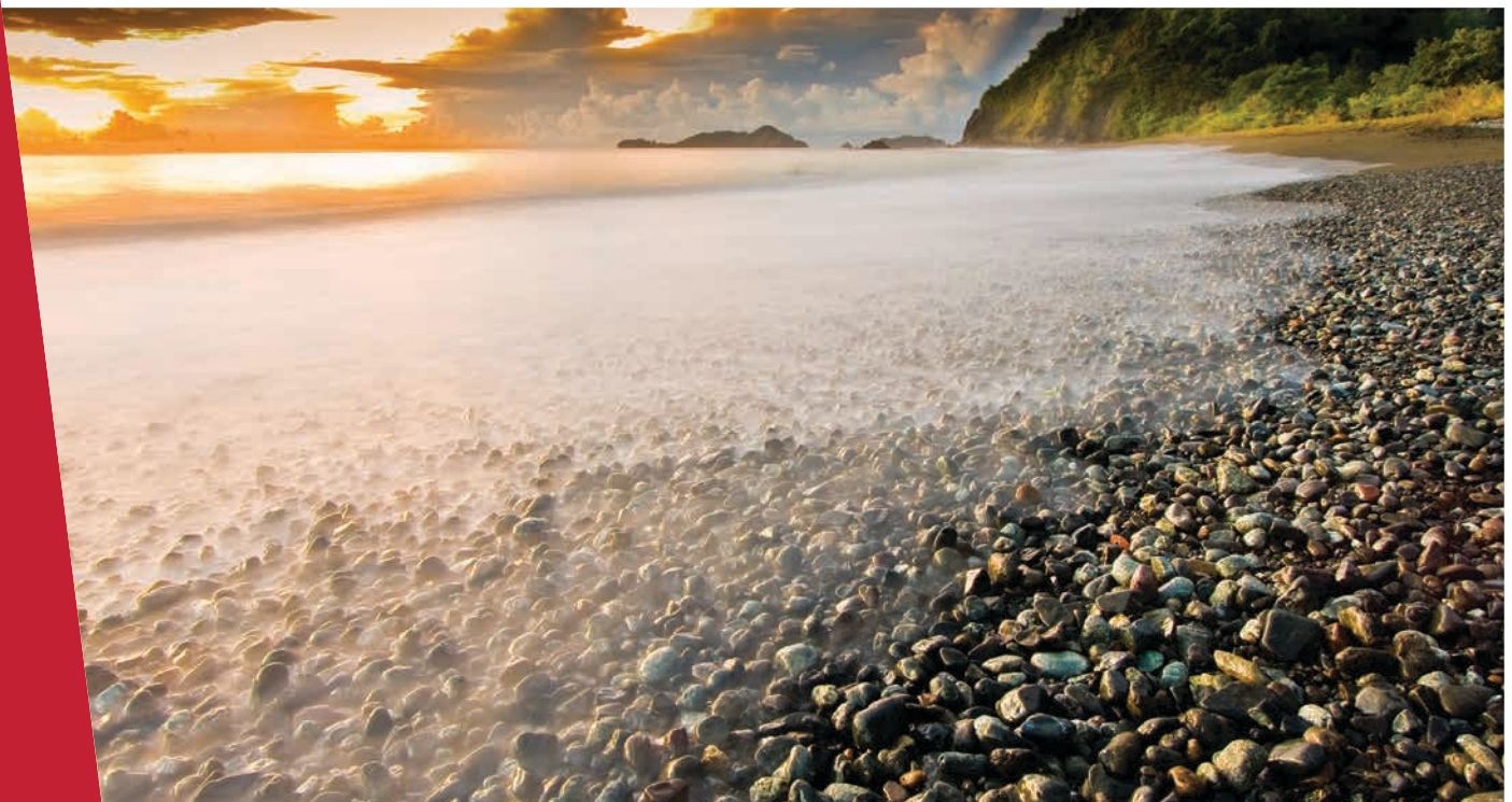
Sunrise on a turtle nesting beach in Central Sulawesi, Indonesia.

The investment strategy comprises a set of strategic funding opportunities—termed strategic directions—broken down into investment priorities that outline the types of activities eligible for CEPF funding. Civil society actors may propose projects that will help implement the strategy by fitting into at least one of the strategic directions. The ecosystem profile does not include specific project concepts, as civil society groups will develop these as part of their applications for CEPF grant funding.