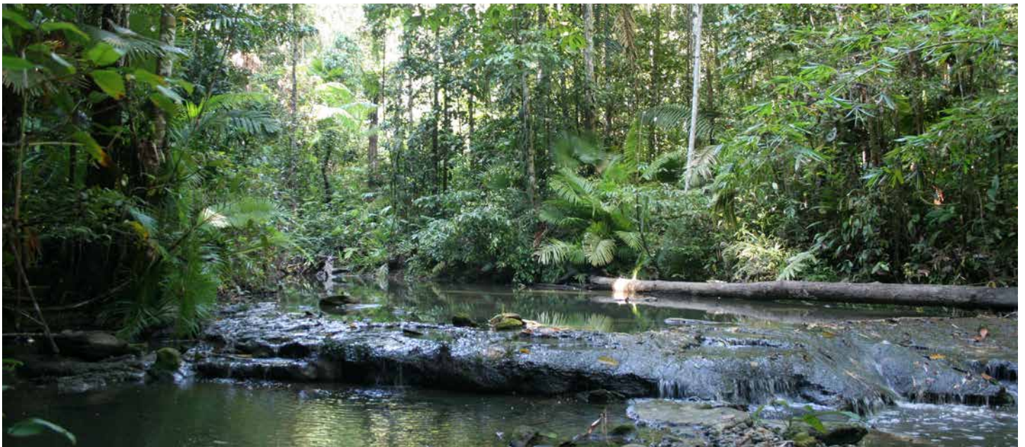
Peda Mangairi River, Halmahera, North Maluku Province, Indonesia.