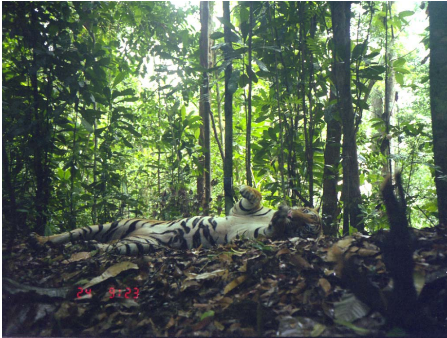
A Malaysian tiger frolics in the leaves of Taman Negara National Park