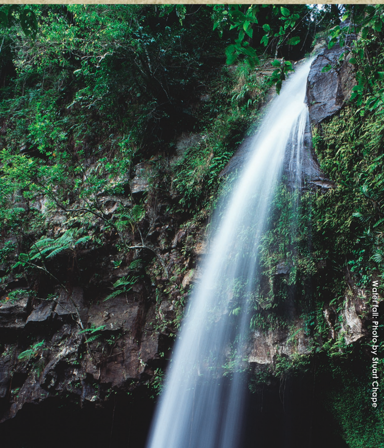
Waterfall: Photo by Stuart Chape

Waterfalls, rivers and clear water streams abound on the island, and the forests are unusually lush with their abundance of ferns and epiphytes. The Ravilevu NR has particularly high landscape values. There are a number of spectacular waterfalls near the coast and some fall straight into the sea.