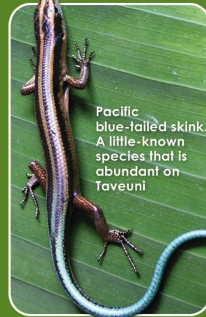
Lizard

Fiji's only endemic bat – the Mirimiri, named so for its affinity to the mist-clad cloud forest of Taveuni.