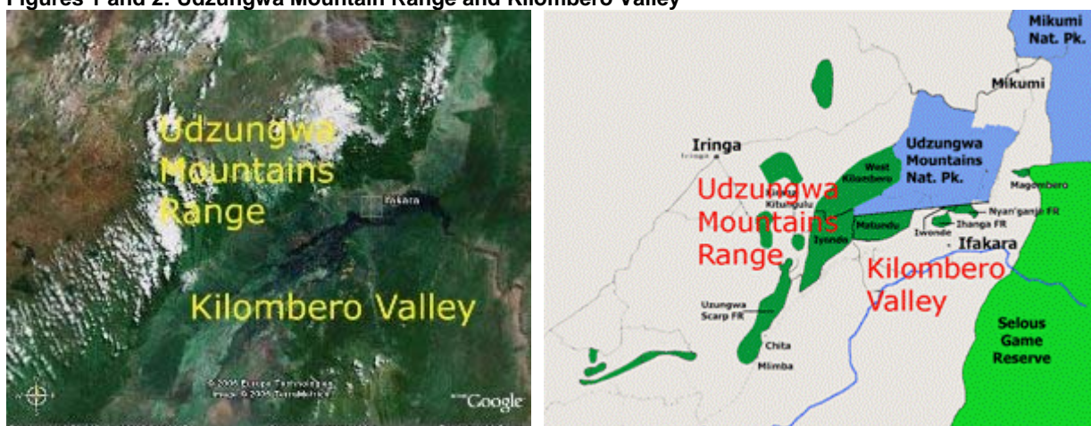
Figures 1 and 2: Udzungwa Mountain Range and Kilombero Valley