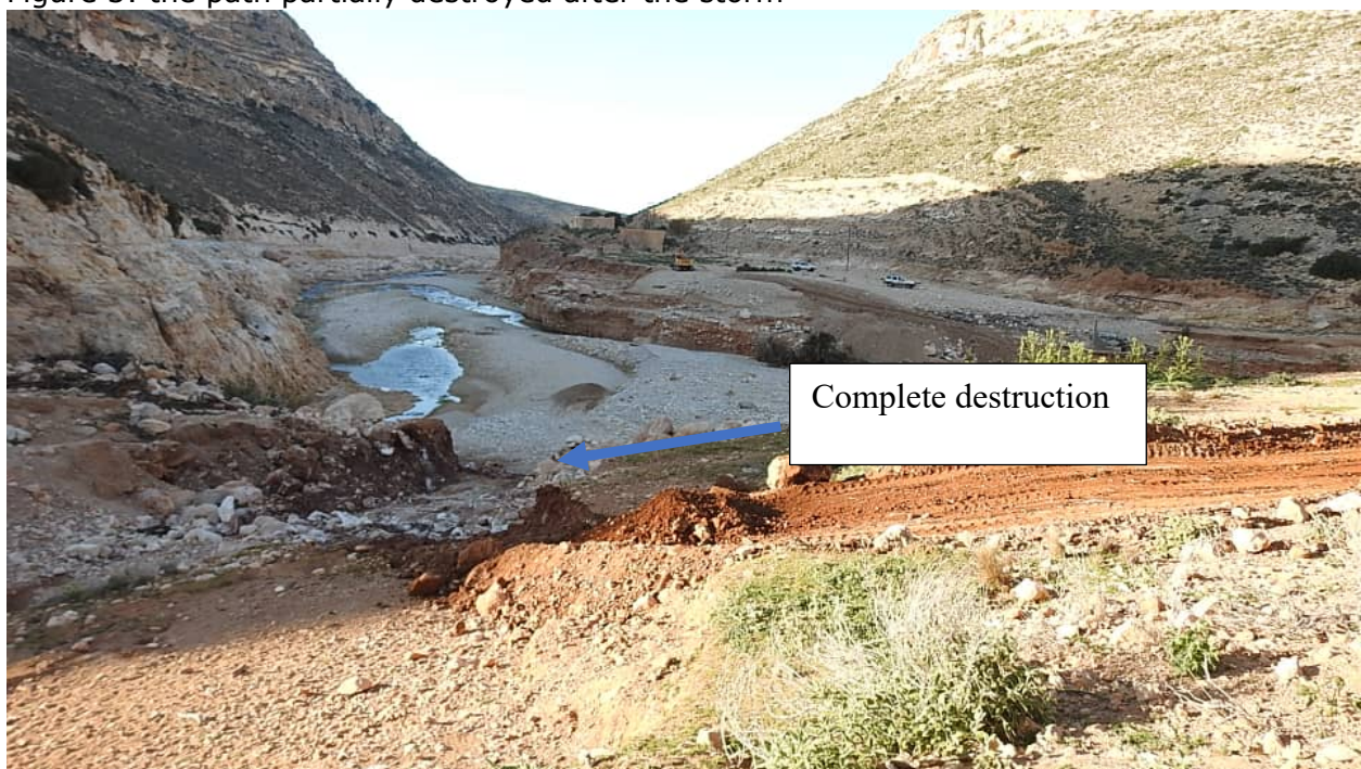
Figure 4: few parts are completely destroyed

The project aim to rehabilitate the path to ensure connection between the protected area and local community. Few householders are based in the protected area. They also will benefit from the path to connect with Derna city.