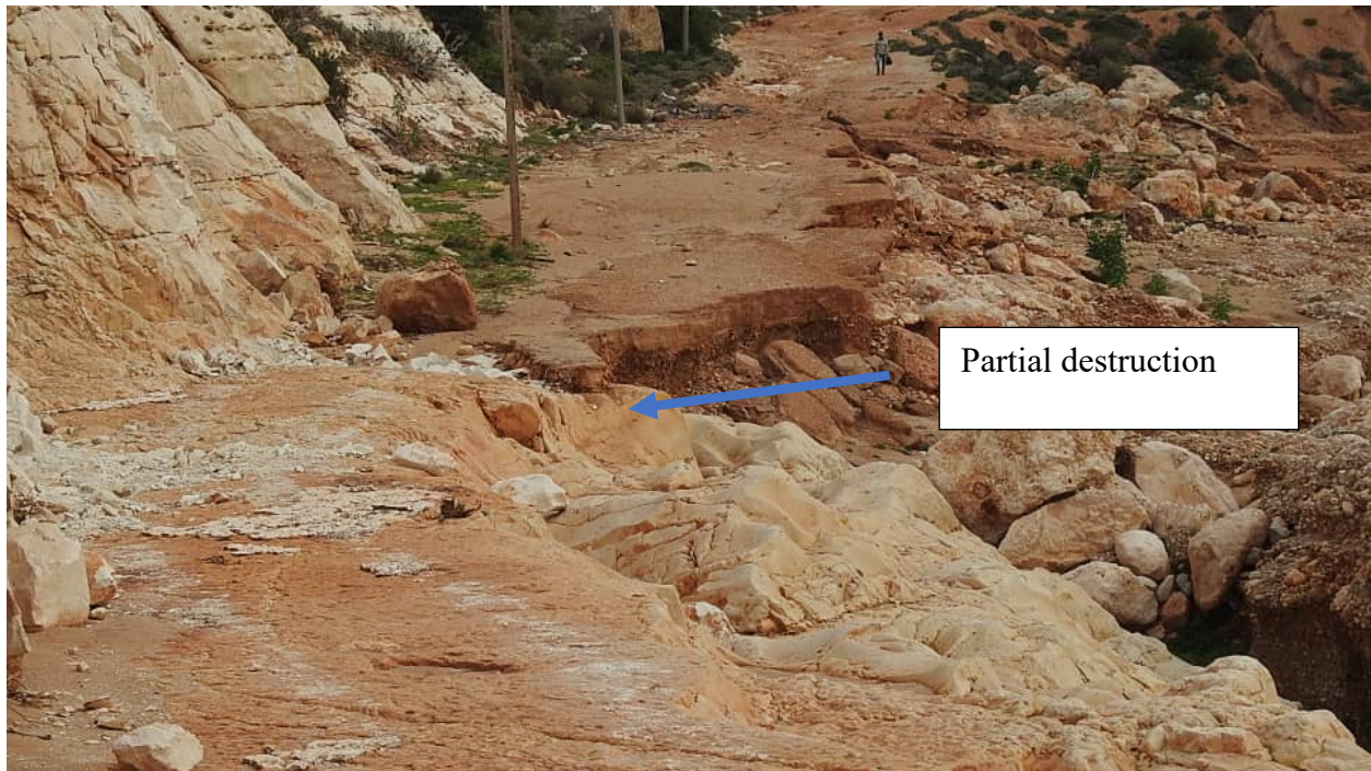
Figure 3: the path partially destroyed after the storm