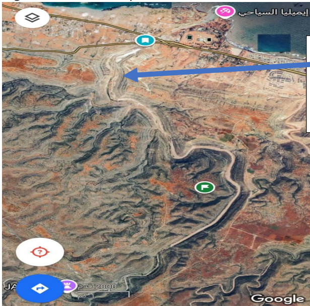
Figure 2: The Path before the Daniel Storm

The storm affected partially the Path in some area, and completely in other area figure 3 and figure 4)