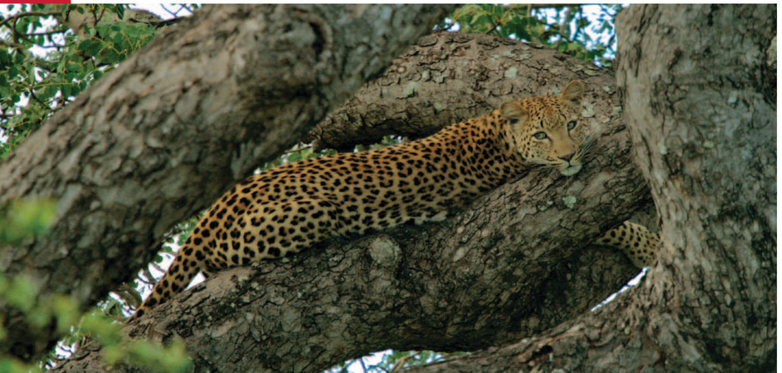
Leopard resting in a tree in the Wild Coast, Eastern Cape, South Africa.