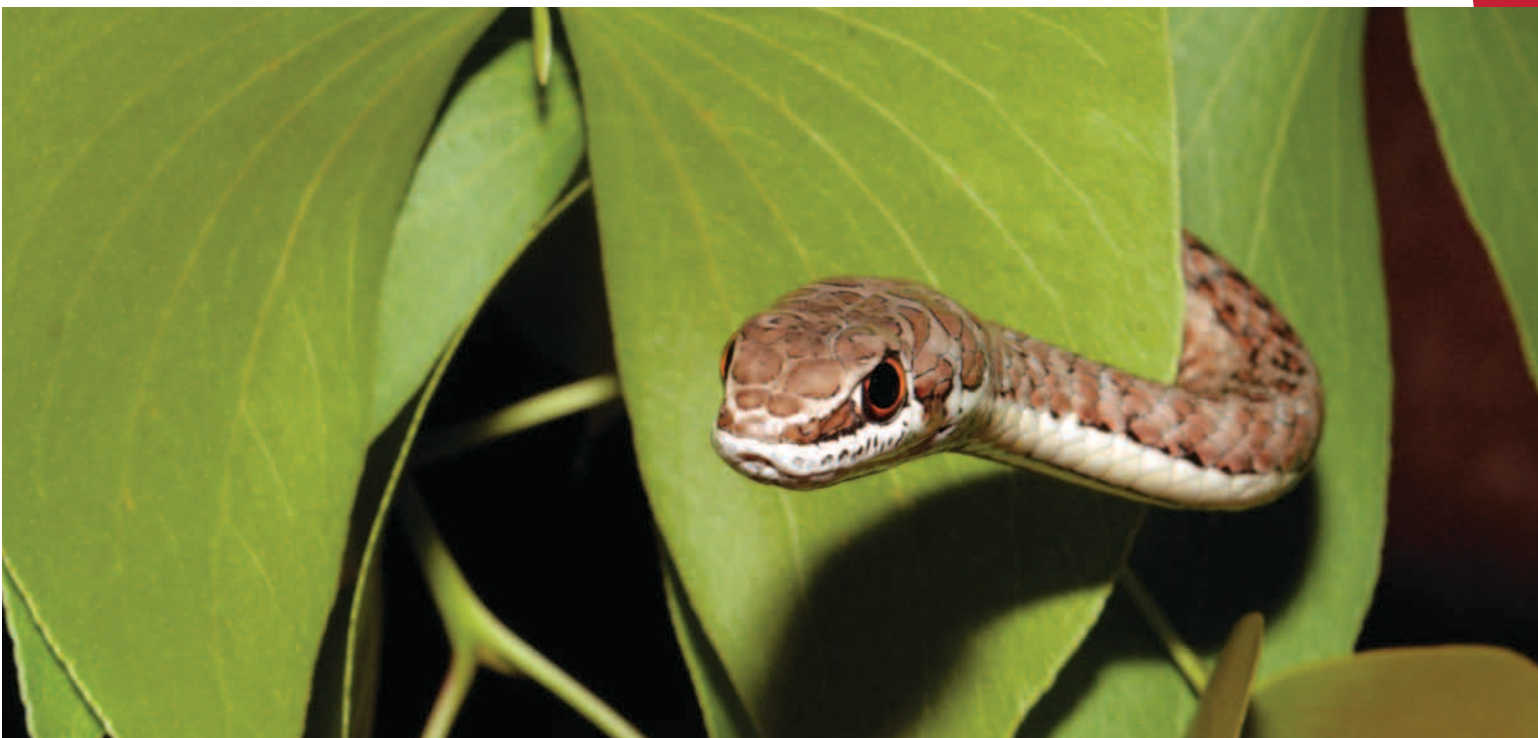
Snake, Wild Coast, Eastern Cape, South Africa.

Currently, there is limited funding in the region to engage civil society organizations and enable them to play a vital role in conservation. Many key biodiversity areas are not formally protected and are inhabited by people who rely on the land for water and other natural resources. Civil society in the hotspot is positioned to take the lead in sustainable conservation within these sites, and it can effectively stimulate partnership between governments and the corporate sector toward conservation of biodiversity.