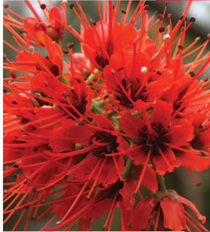
Natal bottlebrush ( Greyia sutherlandii )

This biological diversity and associated ecosystems support the roughly 18.4 million people living in the hotspot. Fresh water generated in the highlands serves the major coastal cities of Maputo, Durban and Port Elizabeth; indigenous insects and flora underly agricultural productivity; and healthy seas are a critical part of the economies of the Eastern Cape, KwaZulu-Natal and southern Mozambique.