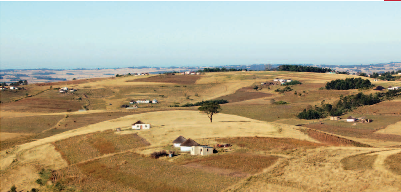
The Pondoland landscape in South Africa's Eastern Cape is home to an immense diversity of endemic plants, but is threatened by poor grazing practices and mining.

These predicted warming and drying trends have important implications for the conservation of the region's biodiversity. The prioritization of key biodiversity areas includes identifying those areas that are most important for climate change resilience. Beyond intact and connected landscapes, it is also important to protect landscapes of high topographical diversity, gorges and steep valleys, and south-facing slopes. These provide areas of refuge from the expected temperature and moisture impacts of climate change.