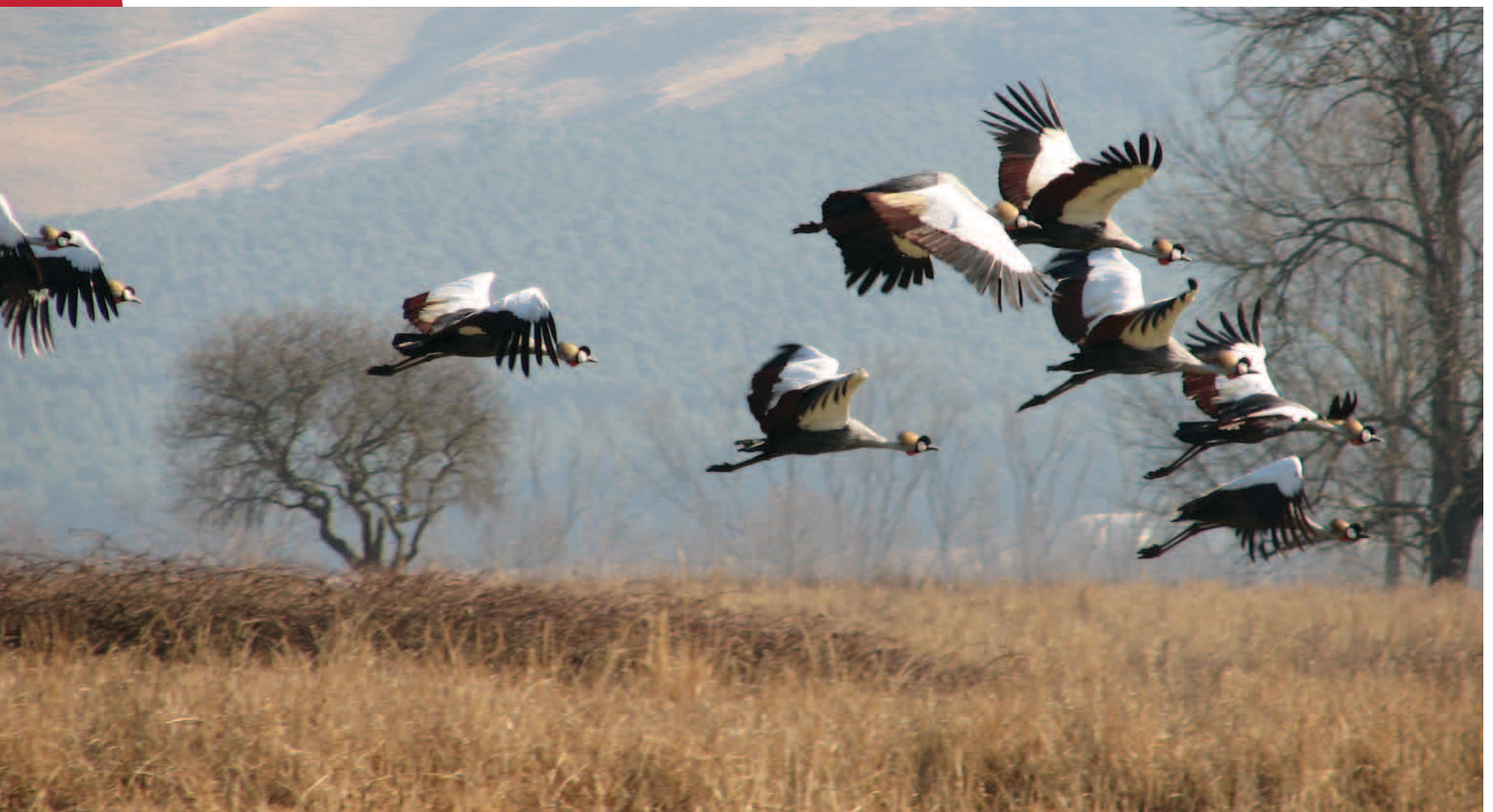
Grey crowned cranes ( Balearica regulorum ), Karkloof Conservation Centre, KwaZulu-Natal, South Africa.

It also contains a five-year investment strategy for CEPF in the region. This investment strategy comprises a series of strategic funding opportunities, called strategic directions, broken down into a number of investment priorities outlining the types of activities that will be eligible for CEPF funding. The ecosystem profile does not include specific project concepts. Civil society groups will develop these for their applications to CEPF for grant funding.