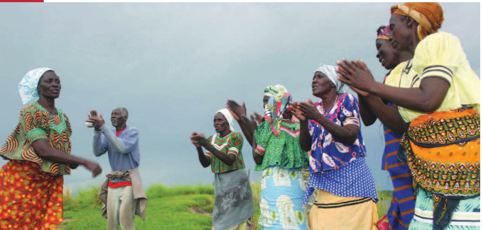
Group in Haga Haga, South Africa, performs a song. Community groups are among the types of civil society organizations that can play a critical role in conserving the ecosystems of Maputaland-Pondoland-Albany.

South Africa has significant investment from dozens of private foundations and corporations, as well as bilateral donors. Swaziland, with the smallest land area, has the smallest amount of external investment—a $2 million GEF-funded effort to restore the Utushu River. Within this context, CEPF has designed a niche for its funds.