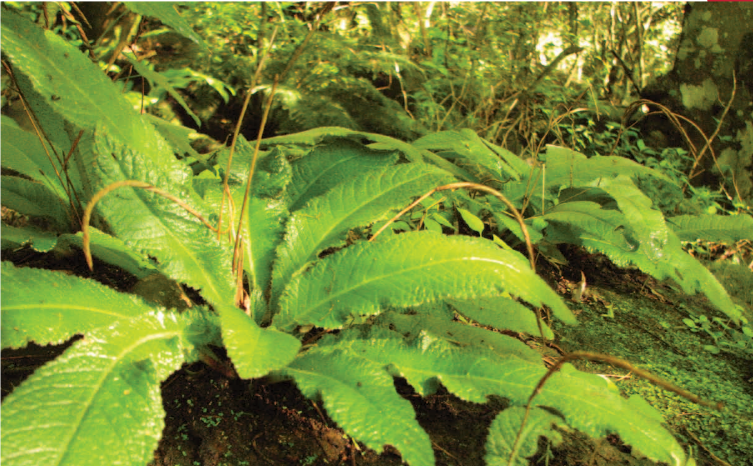
Streptocarpus on rock in Kilgobbin Forest, KwaZulu Natal, South Africa.

Its status as a hotspot, as well as the unique biological, economic and cultural importance of the region, led the Critical Ecosystem Partnership Fund (CEPF) to create a conservation strategy for the entire hotspot. The strategy, known as the Maputaland-Pondoland-Albany Biodiversity Hotspot Ecosystem Profile, guides CEPF’s highly targeted investment in the region—$6.65 million, to be disbursed via grants to civil society, including nongovernmental organizations, researchers, community associations and private businesses. But the profile, which was developed through the input of 75 organizations based in or working in the region, is much more than CEPF’s strategy. It offers a blueprint for future conservation efforts in the Maputaland-Pondoland-Albany Hotspot and cooperation within the donor community.