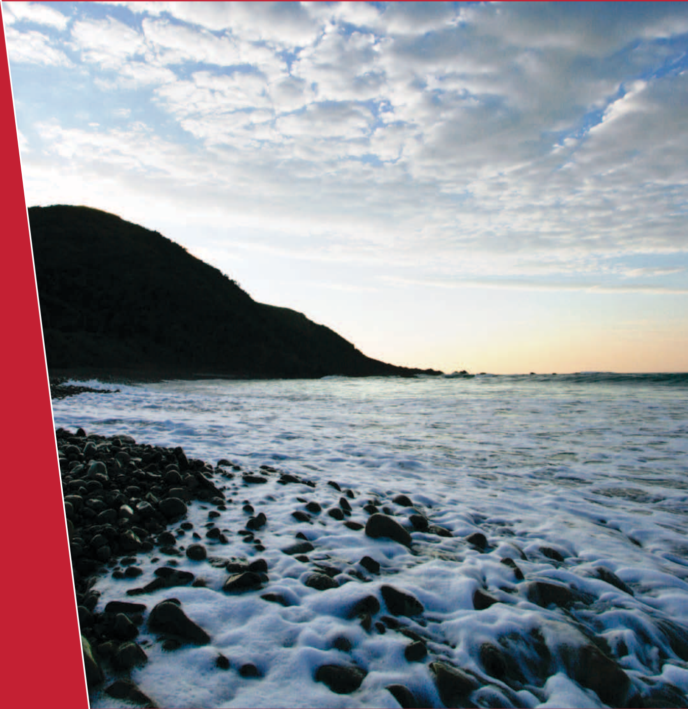
Sunrise in the Transkei area of the Eastern Cape, South Africa.