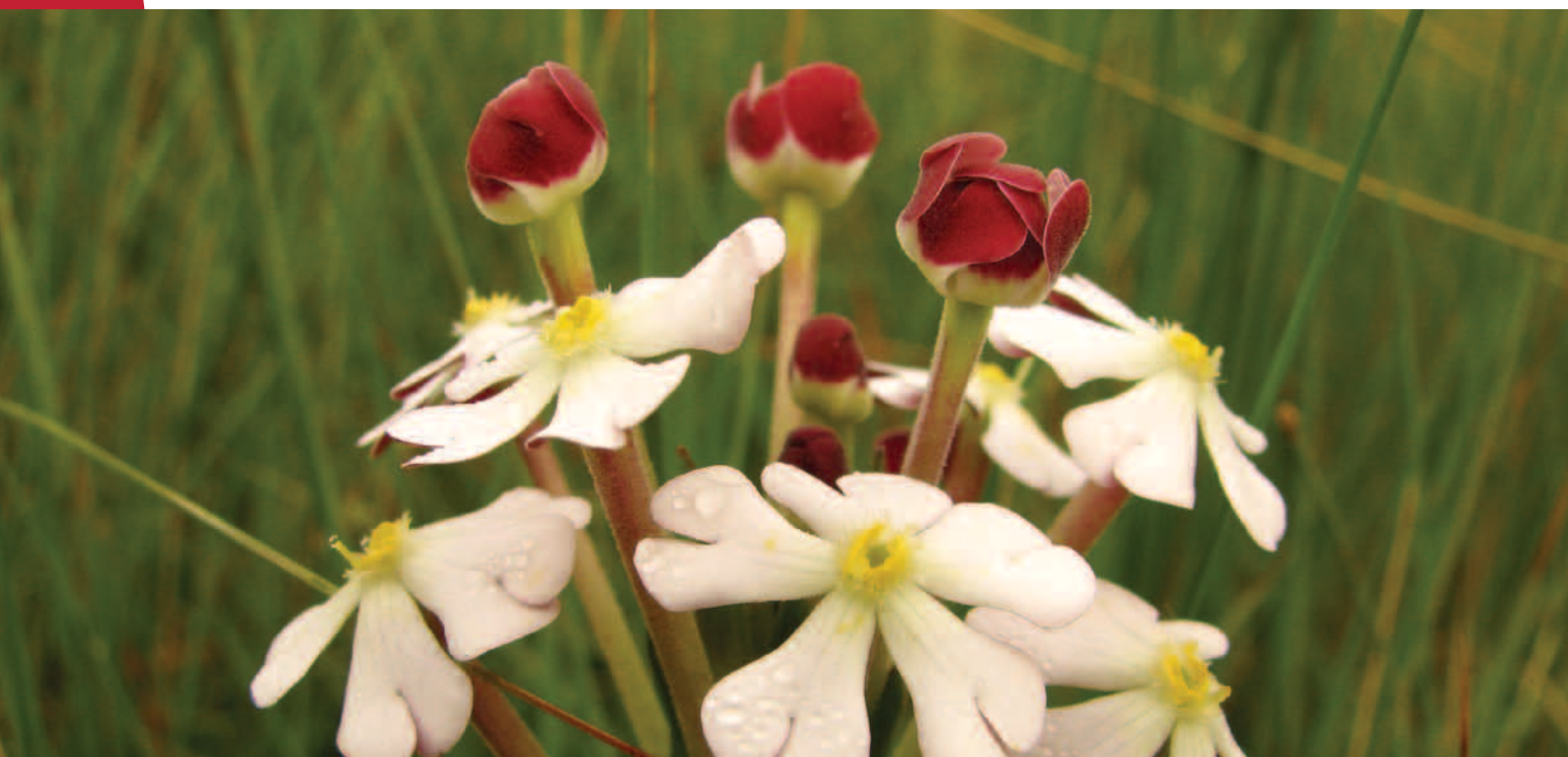
Zaluzianskya natalensis found in Dargle, KwaZulu-Natal, South Africa.

The top 25 percent of key biodiversity area priorities, or 18 of the 72 total priority sites identified, were selected for CEPF investment based on combined environmental value, threat and opportunity. Also selected as priorities for investment are three key biodiversity areas in Mozambique and Swaziland (Manhica, Ponto d'Ouro and Licuati Forests and Eastern Swazi Lebombos) because these may have been underrated due to data deficiencies, as well as the Pongola-Magadu Key Biodiversity Area, as it provides the greatest opportunity to deliver conservation and socioeconomic benefits for land reform beneficiaries.