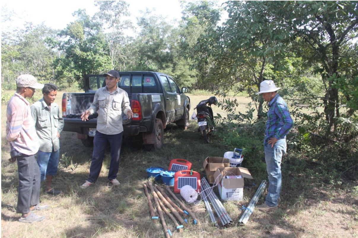
Figure 3: Solar panels and other materials used to instal the electric fence.