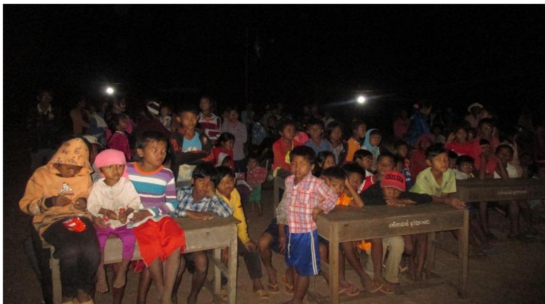
Figure 1. Village meeting in Khes Svay village