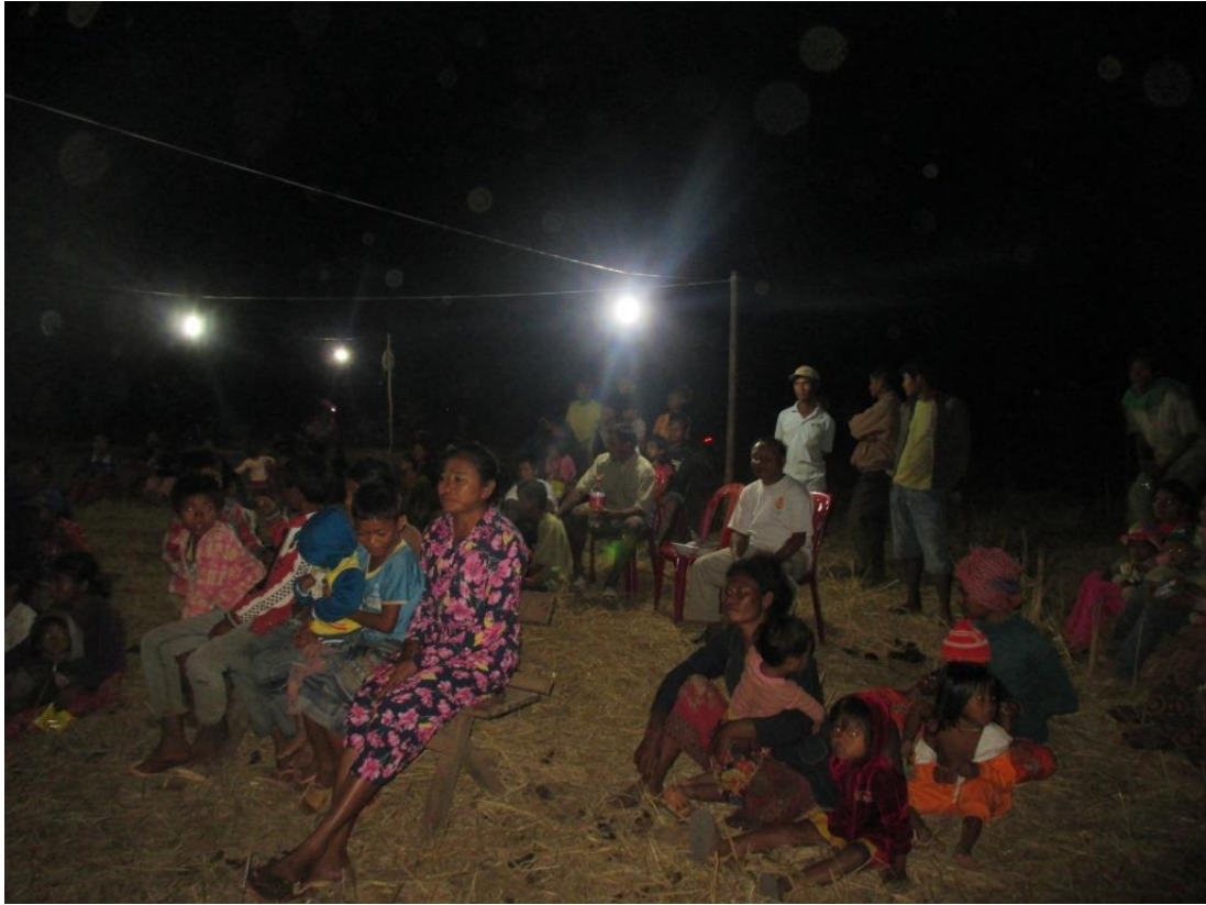
Figure 2: Village meeting in La Kay