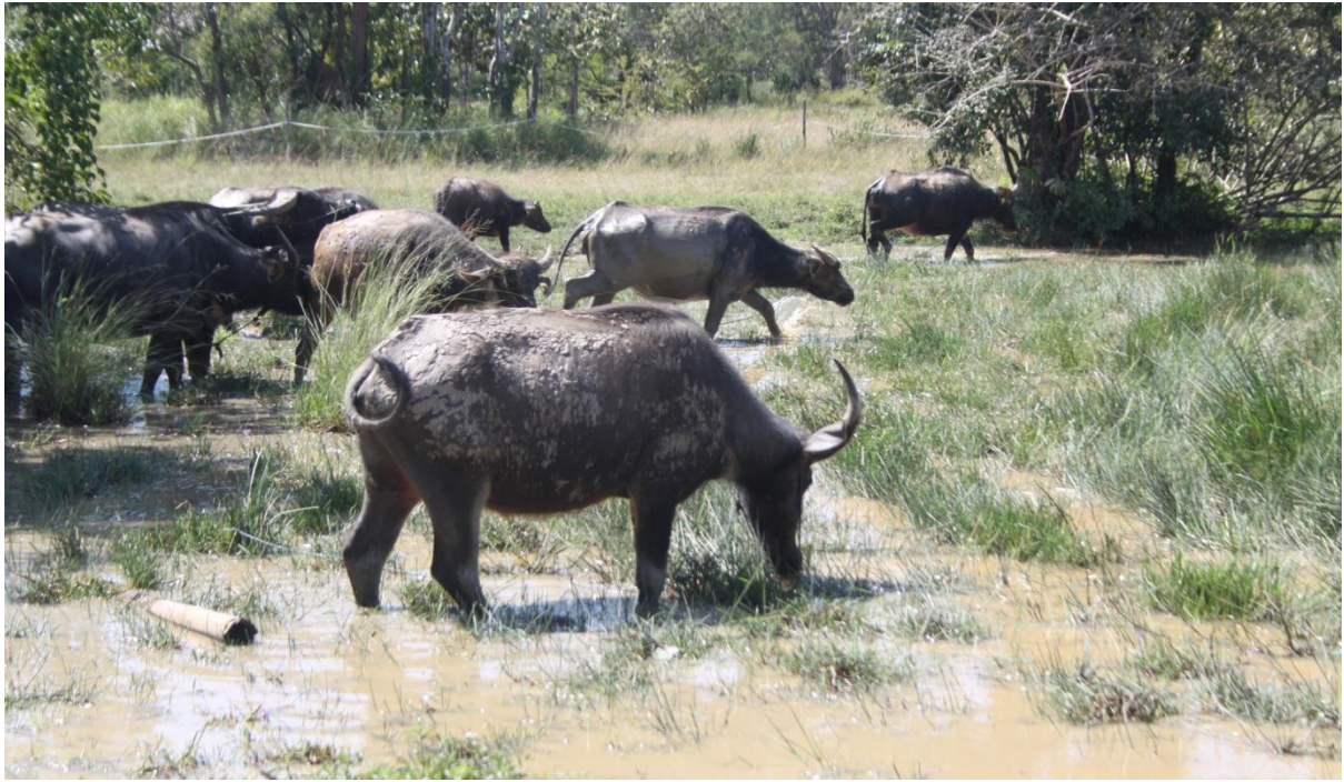
Figure 5: Buffalo herd grazing inside the fenced trapeang