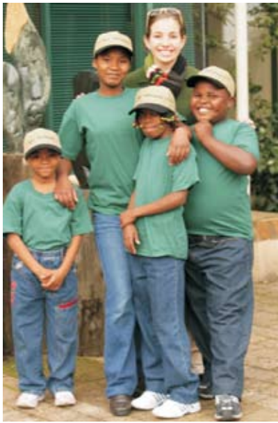
This team from the Baviaanskloof used theatre to convey their message about the importance of the Baviaanskloof mega-reserve, one way to catch and hold attention.