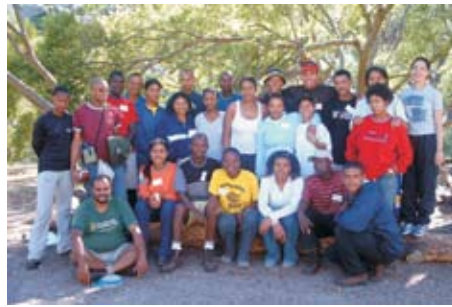
Proud graduates of the first Youth Service Programme run by CapeNature.

a loss of momentum; to repeat the course at a later date will require much greater effort than if the course could simply have kept going. Externally funded development projects that provide only short-term funding are problematic, as development is essentially a long-term process.