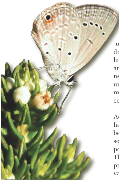
Brenton Blue Champs.

This project aims to demonstrate to both visitors and residents of Nature's Valley and Kurland Village that when natural ecosystems are conserved, people benefit. By ensuring that the Kurland Village development does not negatively impact on the sensitive Salt River ecosystem, not only will the river be more likely to supply sufficient clean water to meet local needs, but the Eco-Guides will be able to earn an income from introducing people to this and other unique ecosystems. This innovative response to a conflict situation promises to address not only concerns about biodiversity conservation and local economic development, but also to contribute to better relationships between neighbouring communities in this part of the Garden Route.