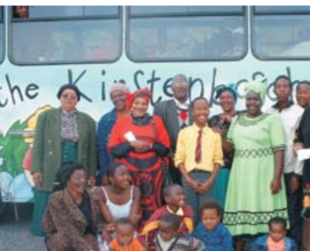
The Kirstenbosch courtesy bus.