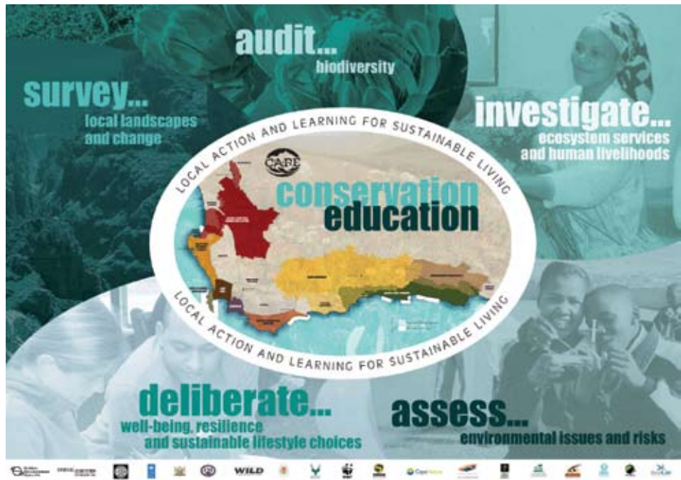
The C.A.P.E. Conservation Education programme has identified opportunities for learning and action that respond to issues of biodiversity and sustainable living in the CFR.

human well-being and lifestyle choices, enabling educators and learners to make informed decisions about living sustainably.