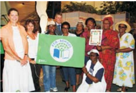
Luzuko Primary School in Gugulethu was one of the first schools in South Africa to receive their Eco-Schools flag.

in some conservation organisations has resulted in the loss of some highly influential environmental educators, centres and programmes.