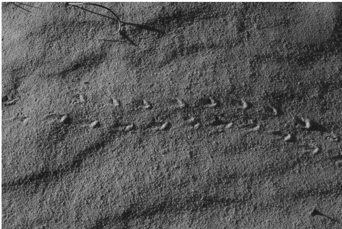
Figure 3. Tracks of the Desert Rain Frog

Visits were made to the active diamond mines at Kleinzee and Koingnaas. Intensive searching was carried out during the day for frog tracks in suitable sandy habitat. This species leaves distinctive tracks (Fig 3), and small mounds where it has burrowed. At night searches were confined to the white coastal dunes.