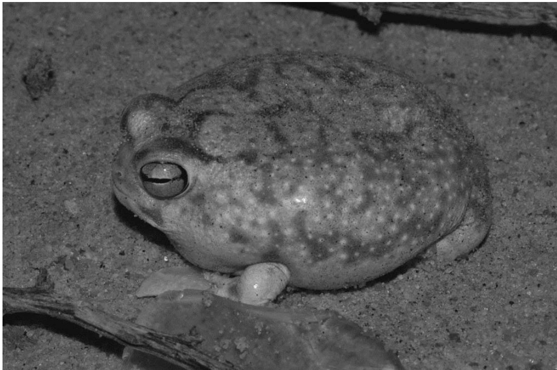
Figure 1. The Desert Rain Frog, Breviceps macrops

The Desert Rain Frog Breviceps macrops belongs to a genus of strange burrowing frogs (Fig 1). They are rotund with short legs and paddle-shaped feet, and able to survive in an arid coastal desert in the Succulent Karoo Biome. Precipitation here is mostly in the form of mist, and averages 45-114 mm per year in the areas where the frog is known (Mucina et al 2006, Jürgens 2006), with occasional rainfall increasing this to at least 146 mm (Channing & Van Wyk 1987). The biology of this species was reviewed by Minter (2004).