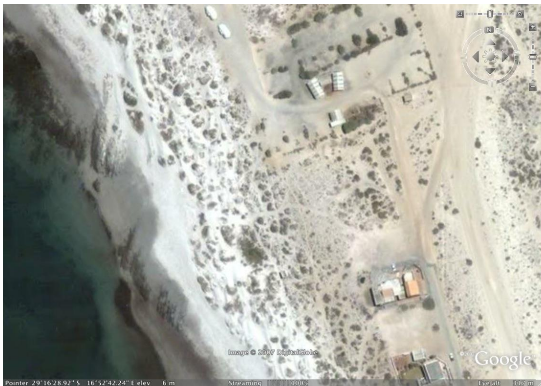
Figure 4. Coastal dunes