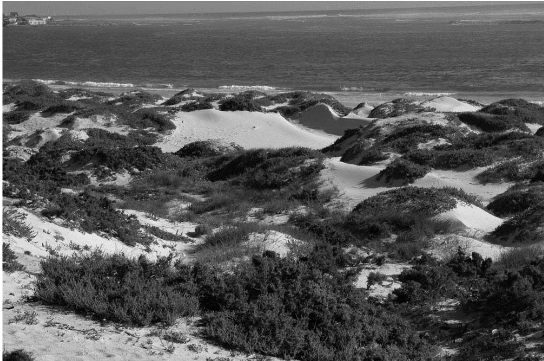
Figure 2. Dune habitat of the Desert Rain Frog

Diamonds are found on the bedrock, below the sand overburden. They are mined by removing the sand, hand-collecting the diamonds or mechanically removing the diamondiferous gravel, and then replacing the sand. After the sand is replaced, the vegetation does not recover naturally in these disturbed areas (Carrick & Krüger 2007). The mines around Kleinzee have been attempting to keep the topsoil separate in this process, so that it can be spread over the deeper sands when the worked-out mine is backfilled. The disturbance to the soil structure is absolute, although work is progressing to determine the best ways to rehabilitate these old mines. South African legislation enacted in 1991 (The Minerals Act) requires that the land surface be restored (Carrick & Krüger 2007). As far as I can determine, there has been no study on rehabilitating the animals on old mine sites, although almost all the Namaqualand reptiles, mammals and amphibians are fossorial, and hence threatened by large-scale soil disturbance. A history of mining and plant restoration in Namaqualand is provided by Carrick & Krüger (2007).