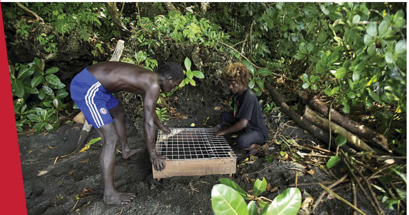
Protecting green turtle ( Chelonia mydas ) nests from predators.

KBAs are the starting point for defining islandscape-level targets, called conservation corridors. These are defined where it is necessary to maintain or establish ecological connectivity, in order to maintain evolutionary and ecological processes or meet the long-term needs of islandscape species. Four islandscales have been defined, covering a total land area of 55,662 square kilometers or 56 percent of the total area of the hotspot.