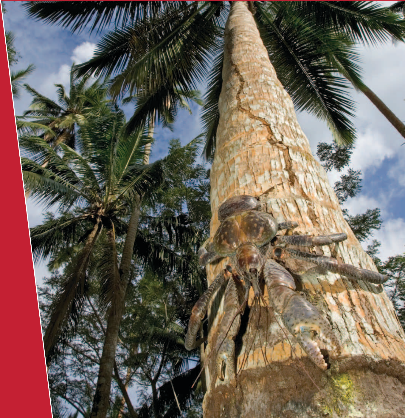
Coconut crab ( Birgus latro ).