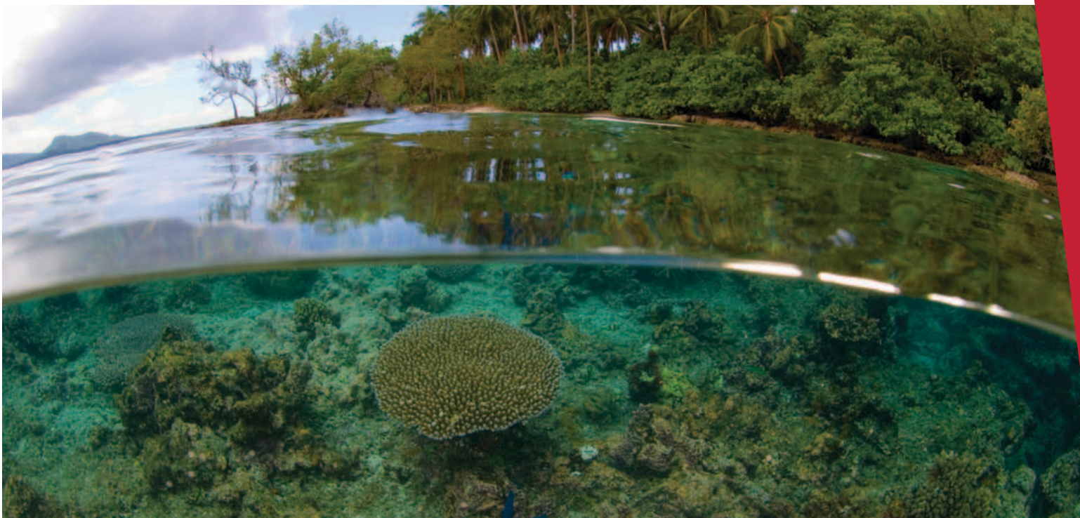
Coastal forest and tropical reef.

Drawing on lessons learned from past conservation programs in the region, conservation interventions will be developed gradually. This will allow sufficient time for trust and understanding to be built among partners, for capacity and knowledge to be transferred, and for long-term funding to be secured. There will also be an explicit focus on capacity building for local and national civil society through partnerships, networks and mentoring. To allow sufficient time for the development of effective partnerships, enduring capacity and sustained on-the-ground results, the CEPF investment period will be for eight years rather than the usual five.