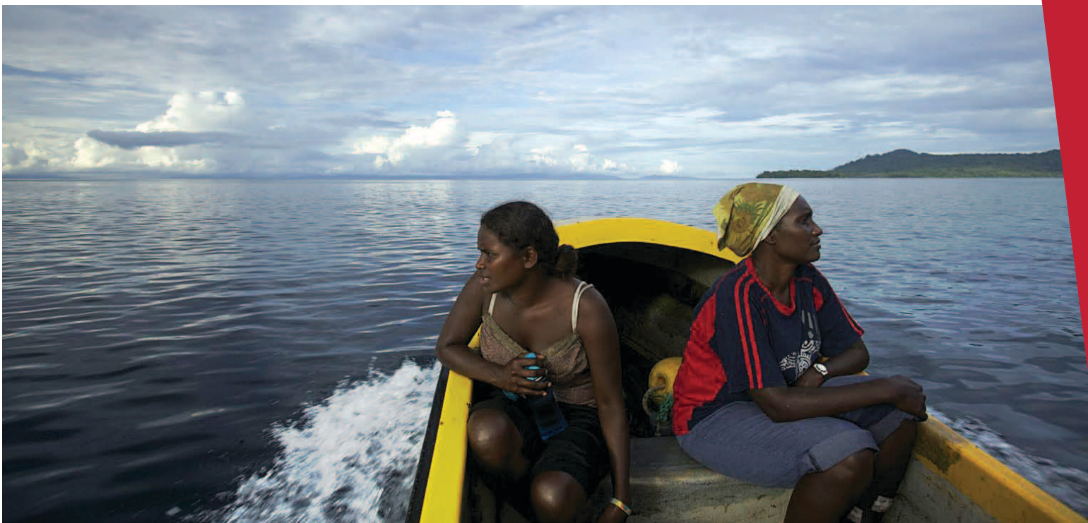
Community leadership includes the voices of women in conservation.

In addition to their terrestrial biodiversity values, the East Melanesian Islands lie partly within the Coral Triangle, whose ecosystems support 75 percent of known coral species and an estimated 3,000 species of reef fishes. Thus, the geographic scope of the hotspot is considered to include nearshore marine habitats, such as coral reefs and seagrass beds, in addition to terrestrial habitats.