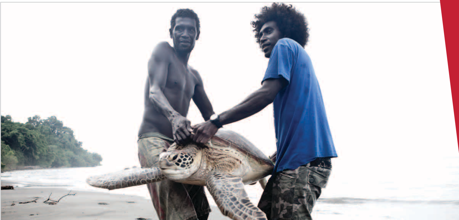
Two Solomon Islanders carry a green turtle up the beach for tagging on Tetapare.

Over the last two decades, the hotspot countries have developed National Biodiversity Strategies and Action Plans, and international civil society organizations have established conservation programs there. Significant investments in conservation have been made over this period but have not always delivered the expected results or left a legacy in terms of local capacity and appreciation of conservation objectives.