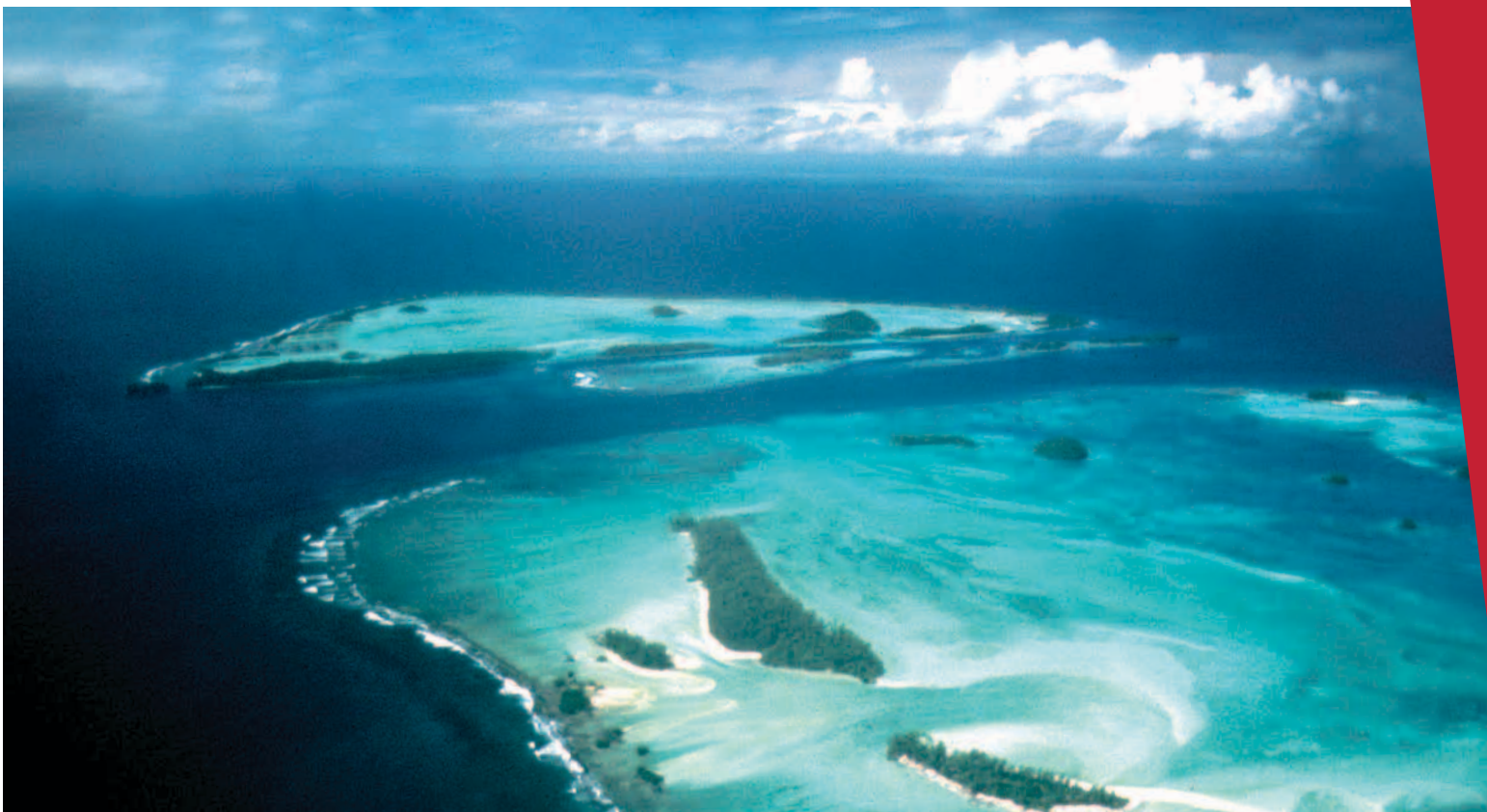
Rennell Island, Solomon Islands.

CEPF's investment in the East Melanesian Islands will be guided by an investment strategy, known as an 'ecosystem profile.' The ecosystem profile presents a situational analysis of the context for biodiversity conservation in the East Melanesian Islands, framing an investment strategy for CEPF and other funders interested in strengthening and engaging civil society in conservation efforts in the hotspot. In this way, the ecosystem profile offers a blueprint for coordinated conservation efforts in the hotspot and cooperation within the donor community.