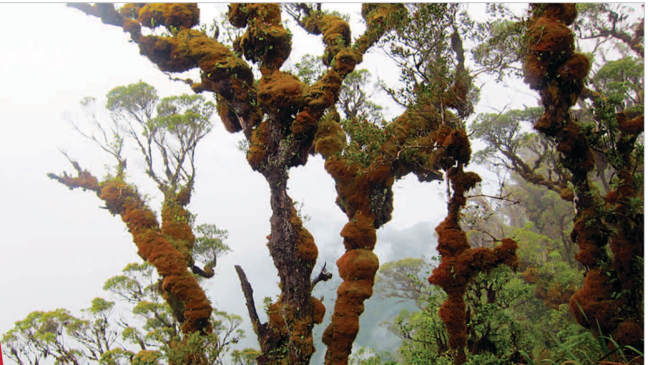
Cloud forests of Kolombangara, Solomon Islands.

The investment strategy comprises a set of strategic funding opportunities—termed strategic directions—broken down into investment priorities outlining the types of activities that will be eligible for CEPF funding. Civil society actors may propose projects that will help implement the strategy by fitting into at least one of the strategic directions. The ecosystem profile does not include specific project concepts, as civil society groups will develop these as part of their applications for CEPF grant funding.