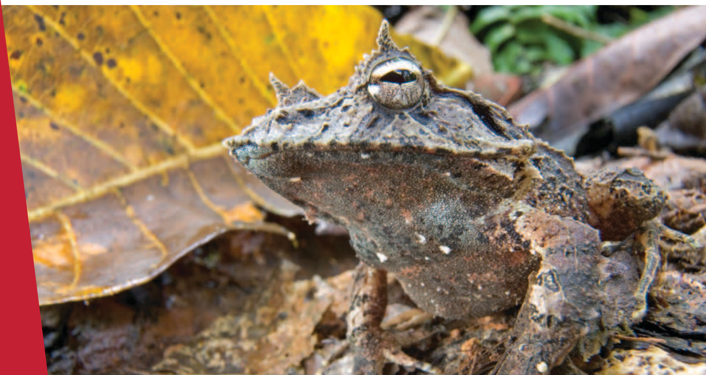
Solomon Island eyelash frog ( Ceratotriton guentheri ).

Of the conservation investments made by international donors during 2007-2012, bilateral agencies, including the governments of the United States, Japan and France, provided around half of the total. Multilateral agencies—including the GEF, the European Union and the United Nations Development Programme (UNDP)—provided a further two-fifths. Investment from private foundations and funds was relatively less but this is considered to be a particularly important source of funding for civil society organizations, especially local and grassroots groups, as it is flexible and relatively accessible. Similar characteristics are credited to the GEF Small Grants Programme, managed by UNDP.