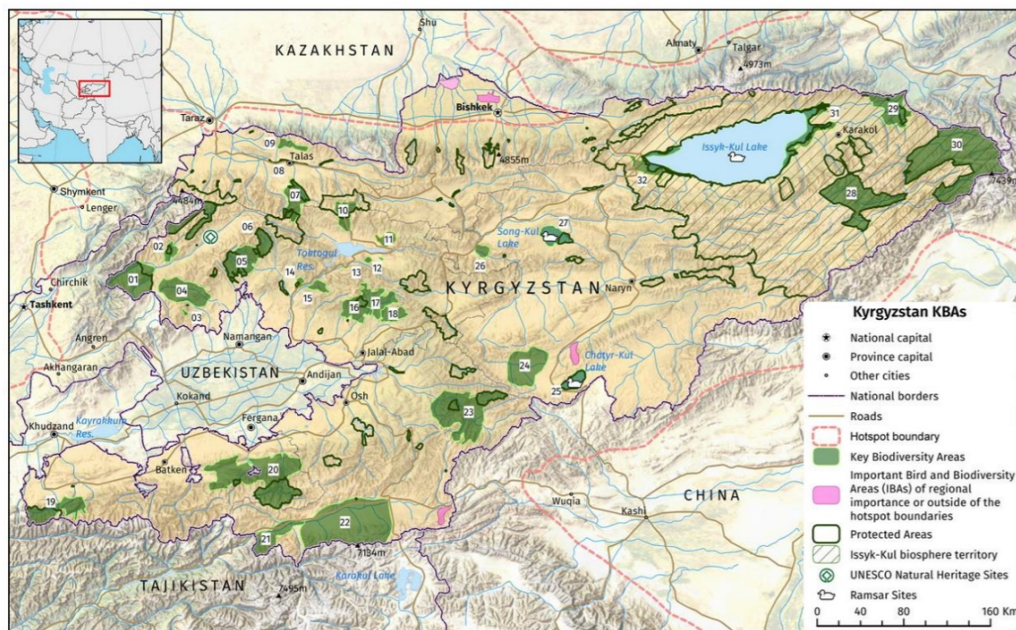
Figure 4.4. Map of KBAs in the Kyrgyzstan part of the Mountains of Central Asia Hotspot

Priority will be given to projects that do not compete with existing projects on individual species. Instead, preference will be given to those projects that focus on larger ecosystem conservation surrounding a KBA or corridor, that replicate proven past methods, and build collaboratively on the work of others.