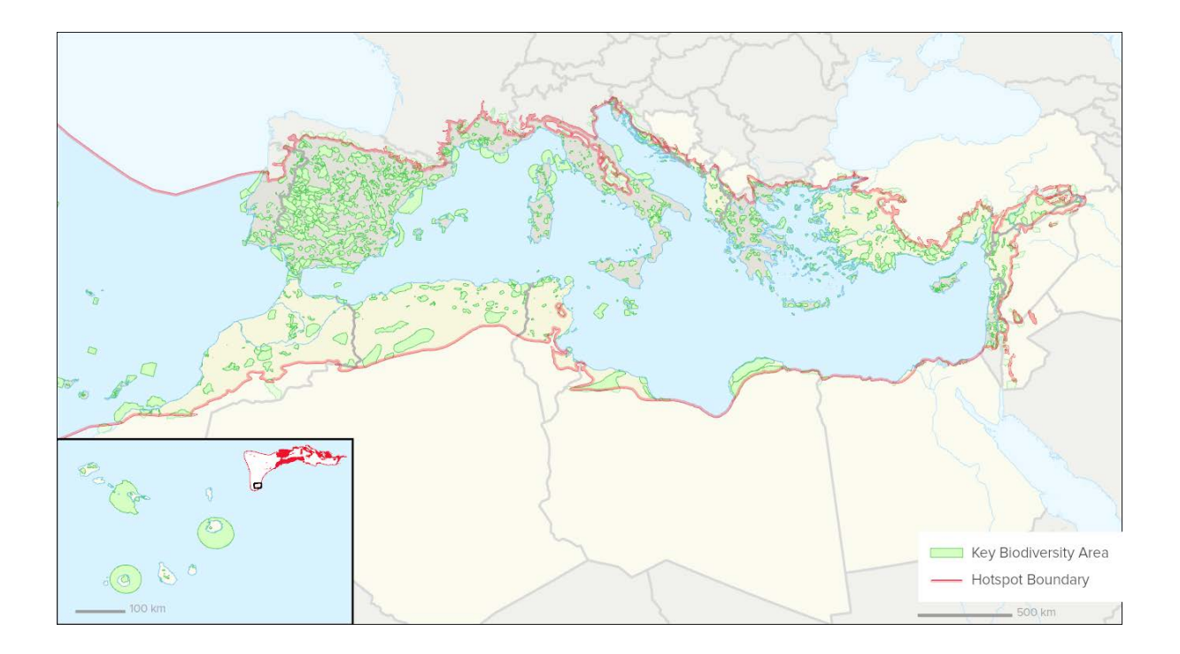
Figure 5.1 KBAs in the Mediterranean Basin Hotspot

The revision of the site outcomes analysis was limited to the countries covered by the update of the ecosystem profile. There have been some limited changes since the 2017 Ecosystem Profile. In total, 572 KBAs were identified for the 17 countries and territories in the Mediterranean Basin Hotspot covered by the update of the ecosystem profile. While KBAs were identified in all countries, there are marked differences between regions, with Türkiye having the highest number of KBAs, and Libya having the greatest proportion of its (rather restricted) land area within the hotspot included in KBAs (Table 5.2, Figure 5.1). Overall, the KBA data is often heterogeneous, as a result of KBA identification based on processes that took place at different time and most of them before adoption of standard methodology.