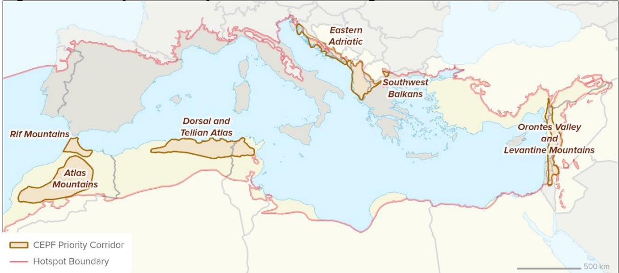
Figure 13.1: Map of Priority Corridors for Strategic Directions 2 and 3

Nevertheless, data analysis also shows that freshwater biodiversity is still poorly known in many parts of the hotspot, possibly leading to bias in terms of priority setting and limiting ability for conservation action. Although many projects supported by CEPF in the previous phase helped reduce this knowledge gap, consultations conducted during the update of the ecosystem profile demonstrated that this need is still there. Also, emerging threats at sites important for freshwater biodiversity may call for urgent actions to document the value of places that were not considered threatened and prioritized previously. For this reason, Investment Priority 2.1, on research and assessment, will be open to other KBAs in the region with the objective to reduce this gap.