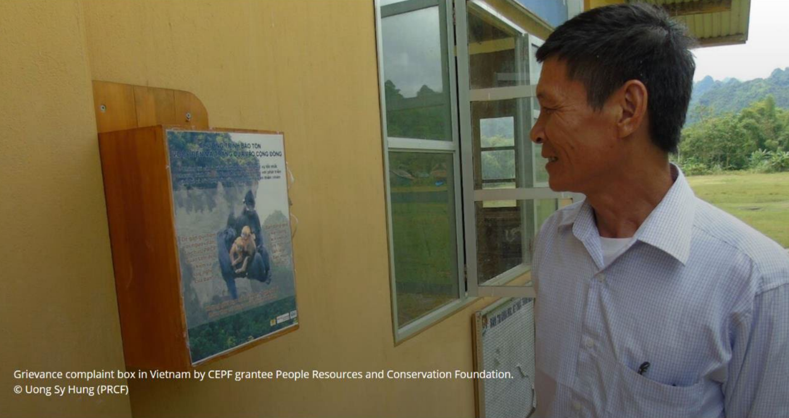
Grievance complaint box in Vietnam by CEPF grantee People Resources and Conservation Foundation.